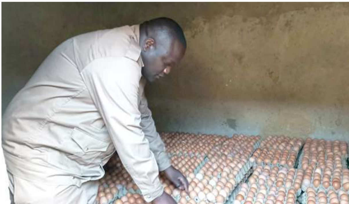
Nsanzubuhoro asarura amagi asaga 2 000 ku munsu

ageze ku nkoko zisaga 6 000 zitera amagi, avuga ko ku munsu abona amagi agera ku 2 100, bivuze amagi 14 700 mu cyumweru cyangwa agera ku 58 800 mu kwezi. Ibi bituma amafaranga yinjiza ava ku musaruro w'amagi agera kuri miliyoni 8,8 Frw buri kwezi.