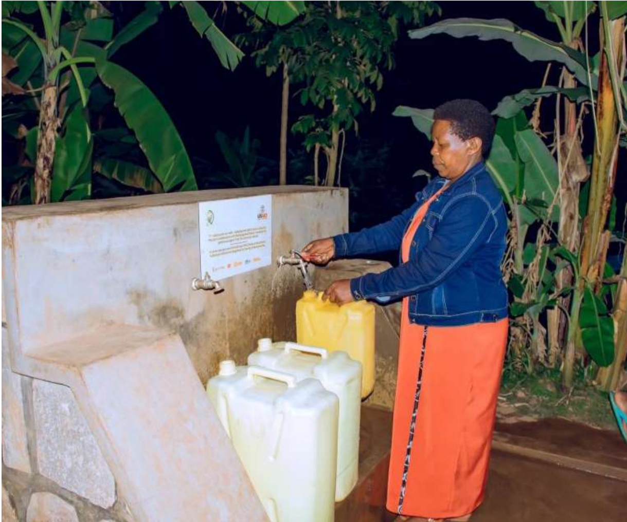
Abaturage bagejewe amazi bahamya ko byabahinduriye ubuzima, bataktivoma ibirohwa