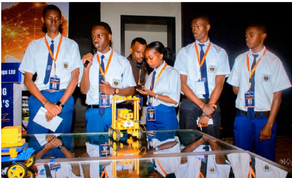
Abanyeshuri batangiye kwifashisha robot mu myigire