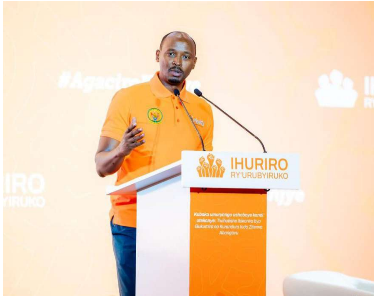
Minisitiri w'Ubuzima, Dr Nsanzimana Sabin yavuze ko mu Rwanda buri munsu abana 60 baterwa inda

Ubuzima (RBC) igaragaza ko ikibazo cy'inda ziterwa abangavu gikomeje kuba ingorabahizi. Mu 2020 habarurwe abangavu 19 701 batewe inda, umubare uzamuka ugera kuri 23 111 mu 2021, wongera kugera kuri 24 472 mu 2022.