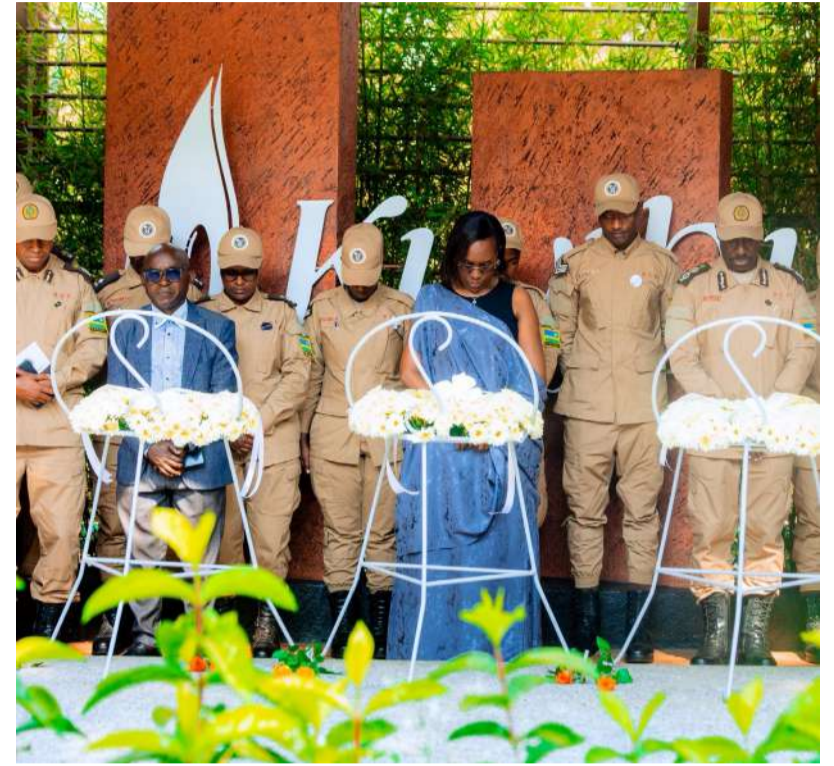
RCS yibutse abari abakozi b'amagereza 18 bishwe muri Jenoside yakorewe Abatutsi mu 1994