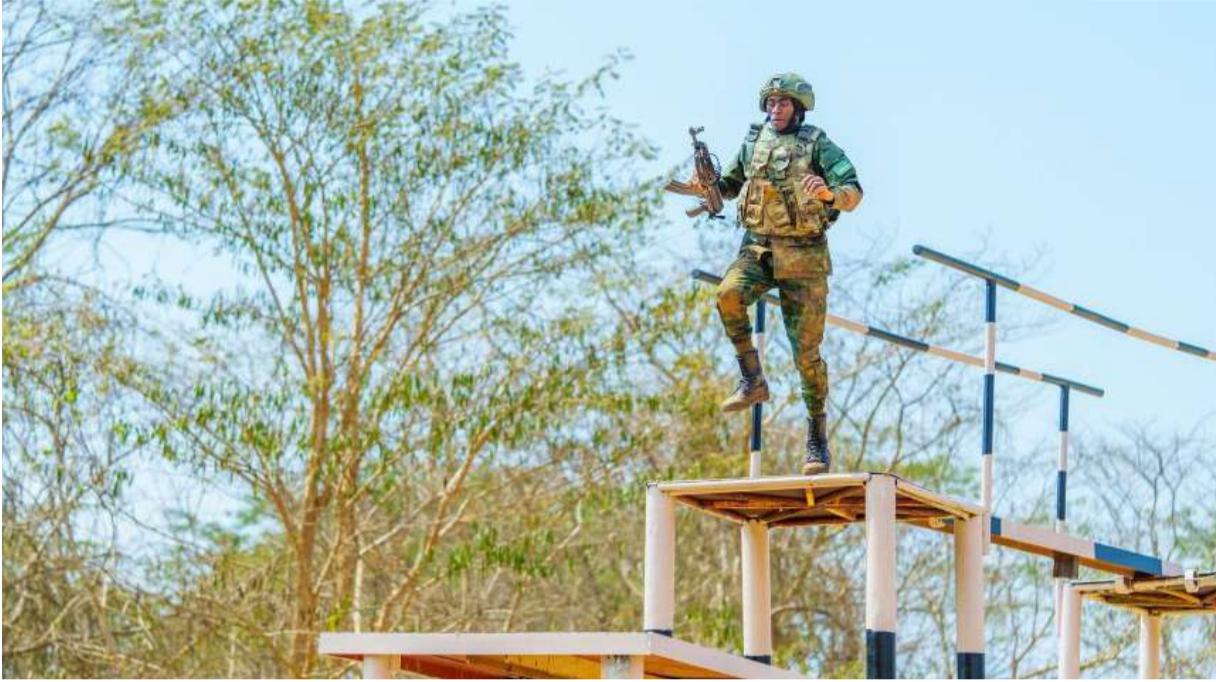
Abasirikare barwanira ku butaka basoje imyitozo