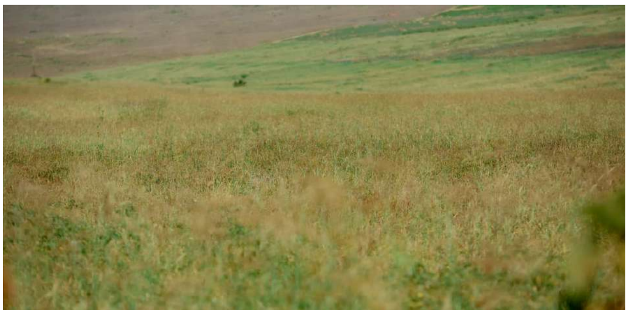
Urubyiruko ruhinga ubwatsi bw'amatungo rufite gahunda yo kongera ubuso bukagera kuri Higitari 100

Yavuze ko mu guhangana n'ibihe by'izuba hakifashishwa 'Dam Sheet' kugira ngo bajye buhira, ubwatsi bwe kubura n'amatungo abone amazi, kuko inka yabonye ubwatsi ikabona amazi, bituma nibura hafi 60 by'amazi