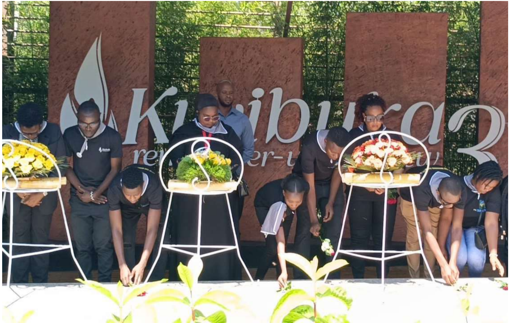
'Winners Team Inkotanyi Cyane' mu rugamba rwo guhangana n'abahakana bakanapfobya Jenoside yakorewe Abatutsi mu 1994

Yagize ati: "Ubu kuba nasuye urwibutso byampaye