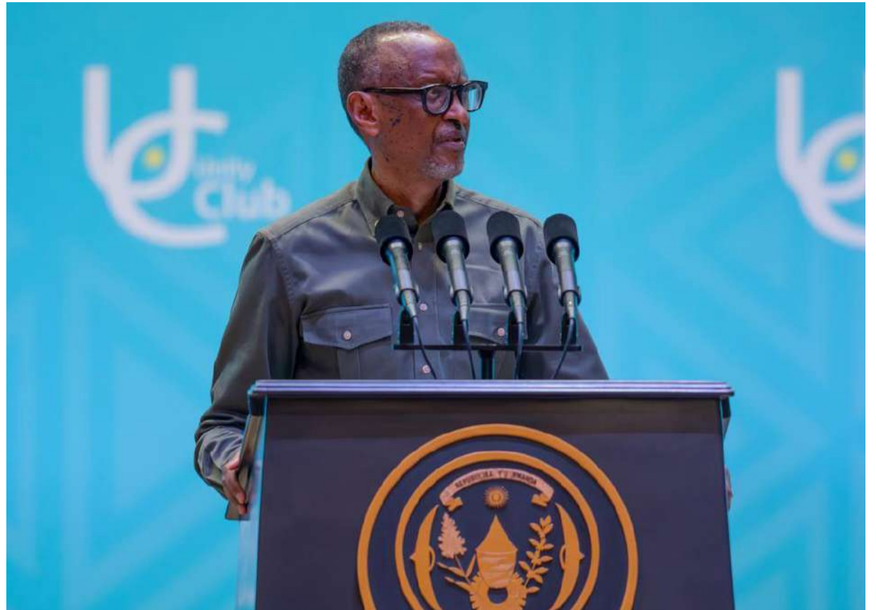
Perezida Paul Kagame yabonye urubyiruko arwibutsa ko rutagomba gushukwa ngo rwemere