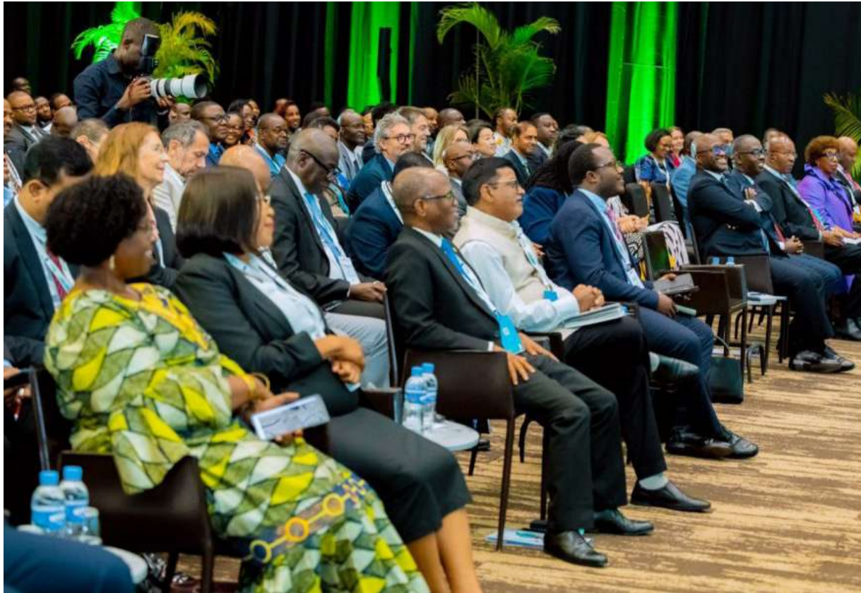
U Rwanda rwakiriye inama yigaga ku bufatanye mu iterambere ry'ibihugu biri mu nzira y'iterambere