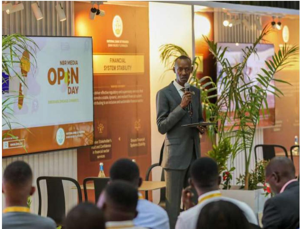
Guverineri Wungirije wa Banki Nkuru y'u Rwanda Hon Nicky Barigye yashimangiye ko abakora umwuga w'itangazamakuru bafatiye runini urwego rw'imari mu Rwanda

Yagaragaje ko ubufatanye hagati ya BNR n'itangazamakuru buzafasha abaturage kubona amakuru yizewe ku rwego rw'imari, bityo bikagira uruhare mu iterambere ry'ubukungu bw'u Rwanda.