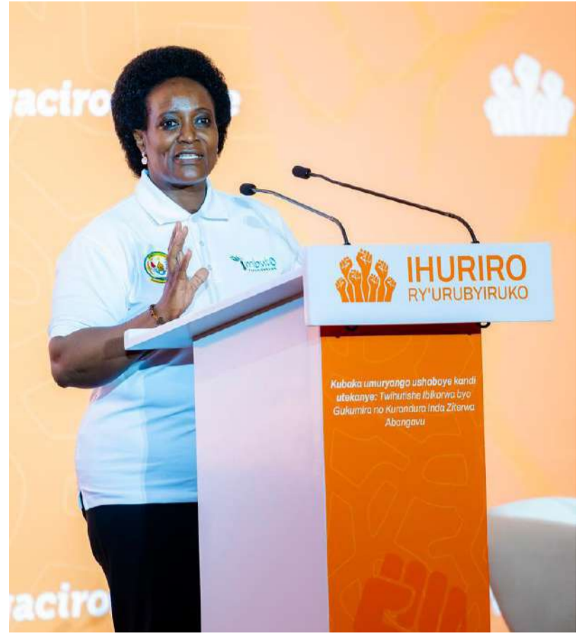
Minisitiri w'Uburin-ganire n'Iterambere ry'Umuryango, Uwimana Consolée yasabye ababyeyi gukurikirana uburere bw'abana babo

Imibare y'ikigo cy'Igihugu gishinzwe Ubuzima mu Rwanda (RBC) igaragaza ko inda ziterwa abangavu zikomeje kuba ikibazo gihangayikishije mu Rwanda.