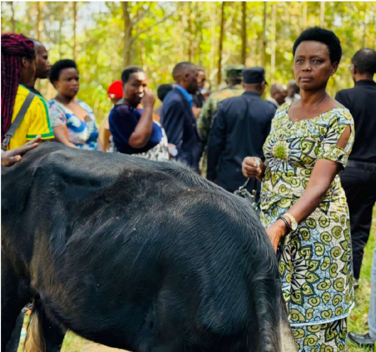
NEC yahaye inka 8 imiryango y'abarokotse Jenoside yakorewe Abatutsi mu 1994

Uhagarariye Umuryango Uharamira Inyungu z'Abarokotse