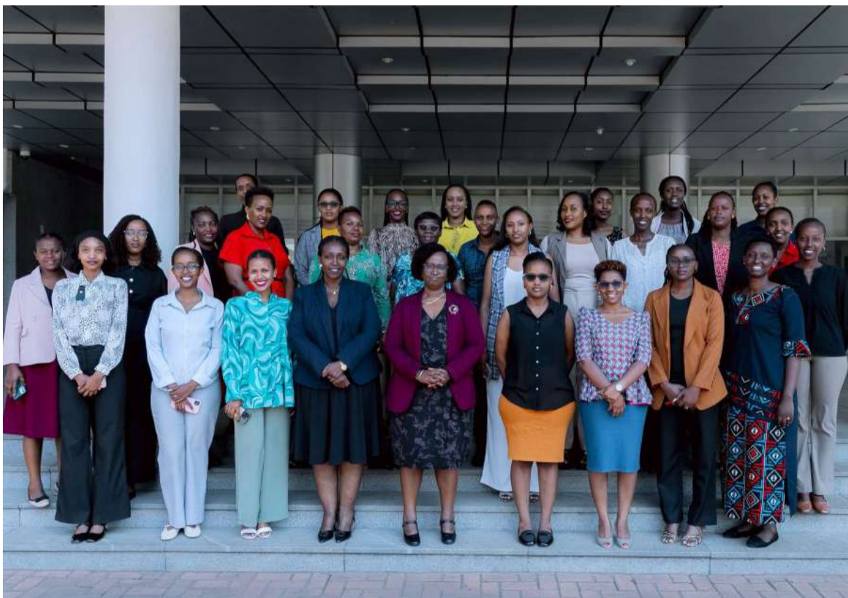
Abanyarwandakazi bakora muri Dipolomasi bizihije Umunsi Mpuzamahanga wabahariwe