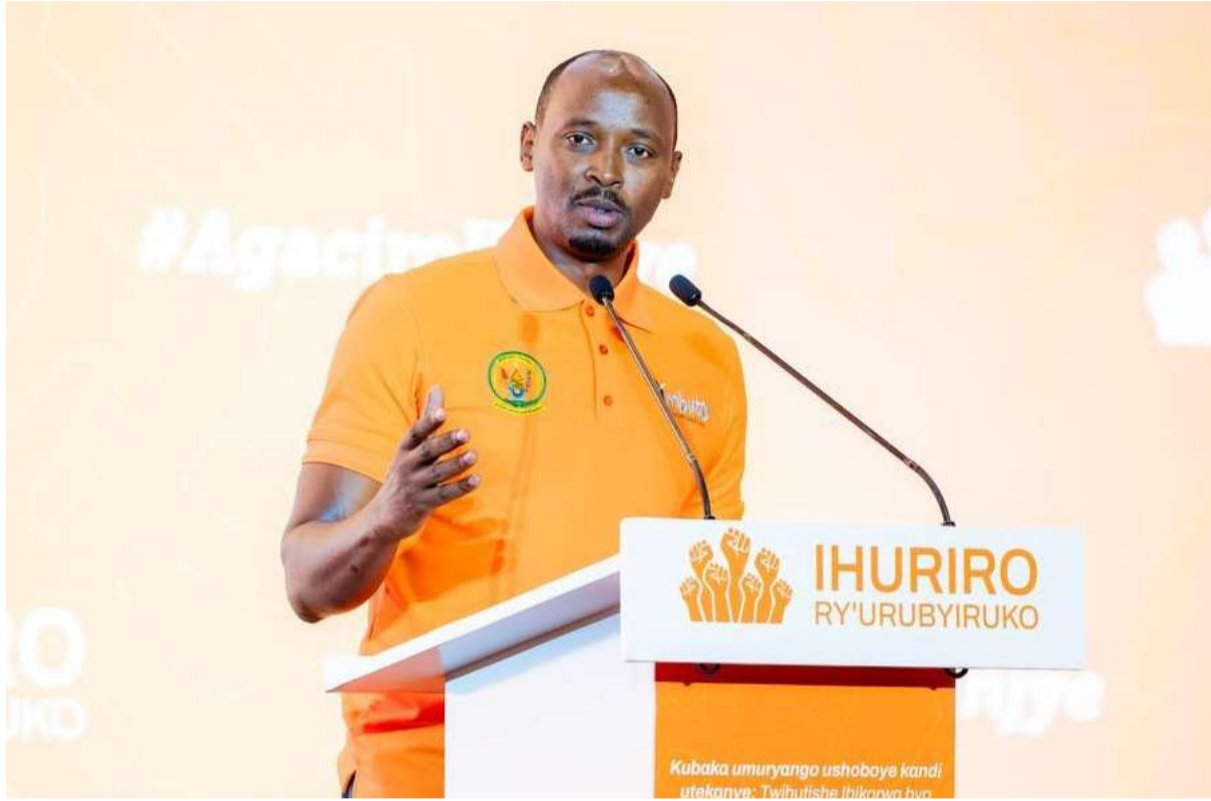
Minisitiri Dr. Sabin Nsanzimana yabwiyeye urubyiruko ko rutatwara inda rudasambanye.

agusigire inda ubuzima bwawe burangire inyungu irimo ni iyihe? Telefone yo gufata ifoto, abantu bakayikunda bikarangirira aho ugatwita, ubuzima bwawe bukarangirira aho ni amah-