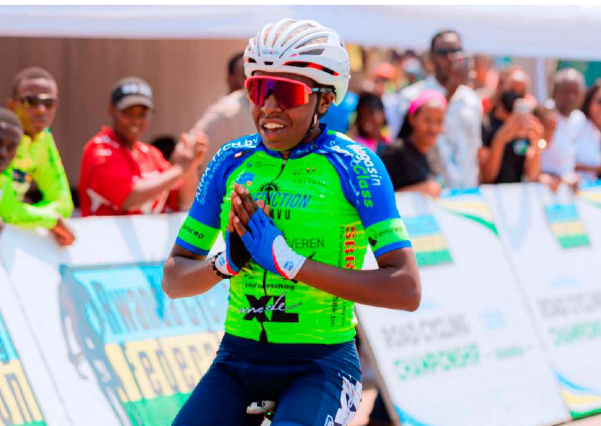
Nzayisenga yongeye kwegukana umwambaro uriho ibendera ry'Igihugu nyuma y'imyaka irindwi