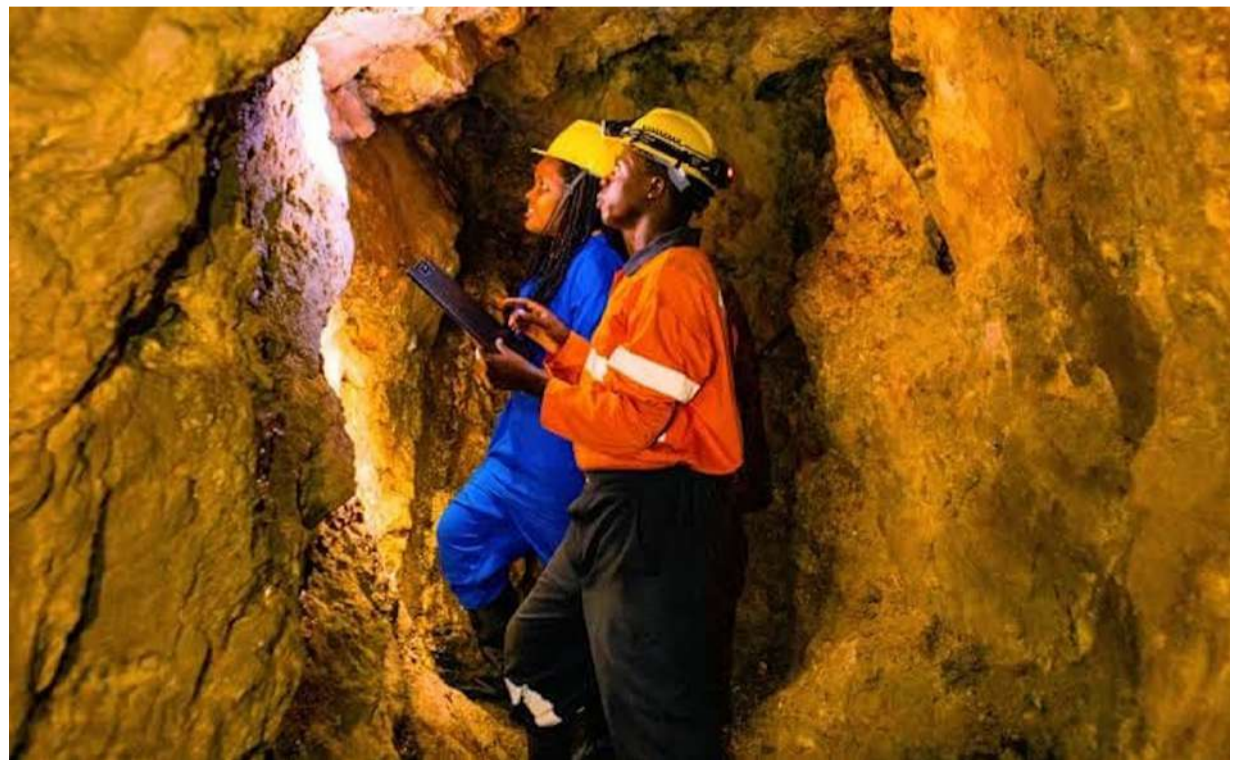
Mu Rwanda hagenda havumburwa amabuye y'agaciro mashya

Yongeyeho ko mu myaka ya vuba mu Rwanda havumbuwe andi mabuye y'agaciro arimo Beryl na Lithium, akomeje gukenerwa cyane ku isoko mpuzamahanga kubera gukoresha