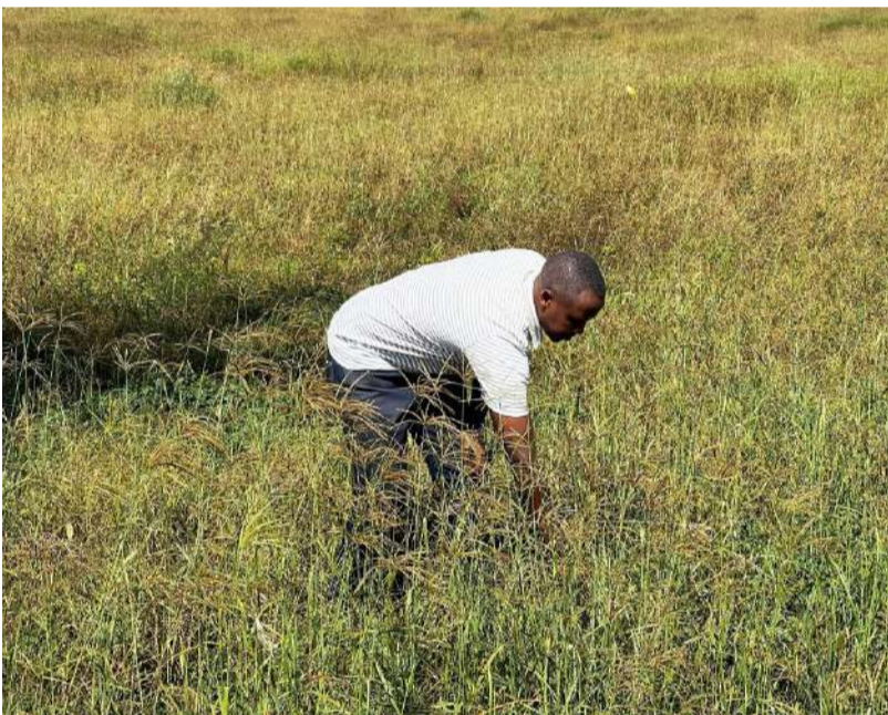
Murenzi uhagarariye urubyiruko rwahinze ubwatsi avuga ko hagamijwe kongera ubwatsi bw'amatungo bateganyaga kubuhinga kuri hegitari 100