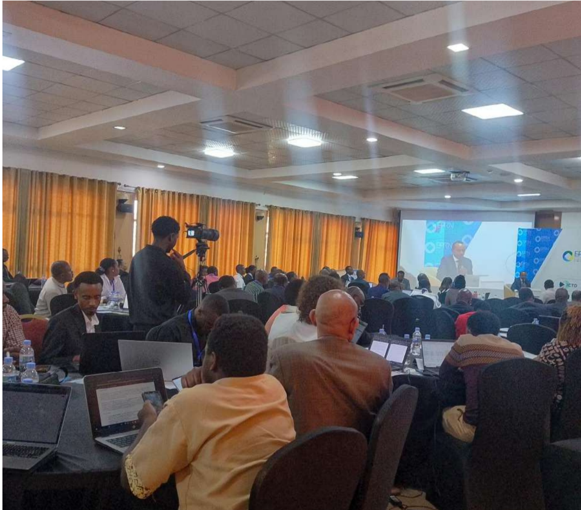
Abashakashatsi mu by'ubukungu bariga uburyo u Rwanda rwahangana n'ihungabana ry'ubukungu