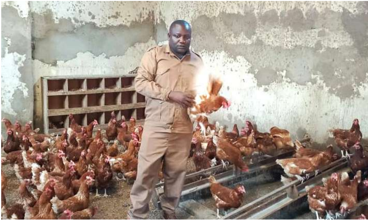
Ubworozi bw'inkoko bumwinjiriza miliyoni 3 Frw buri kwezi