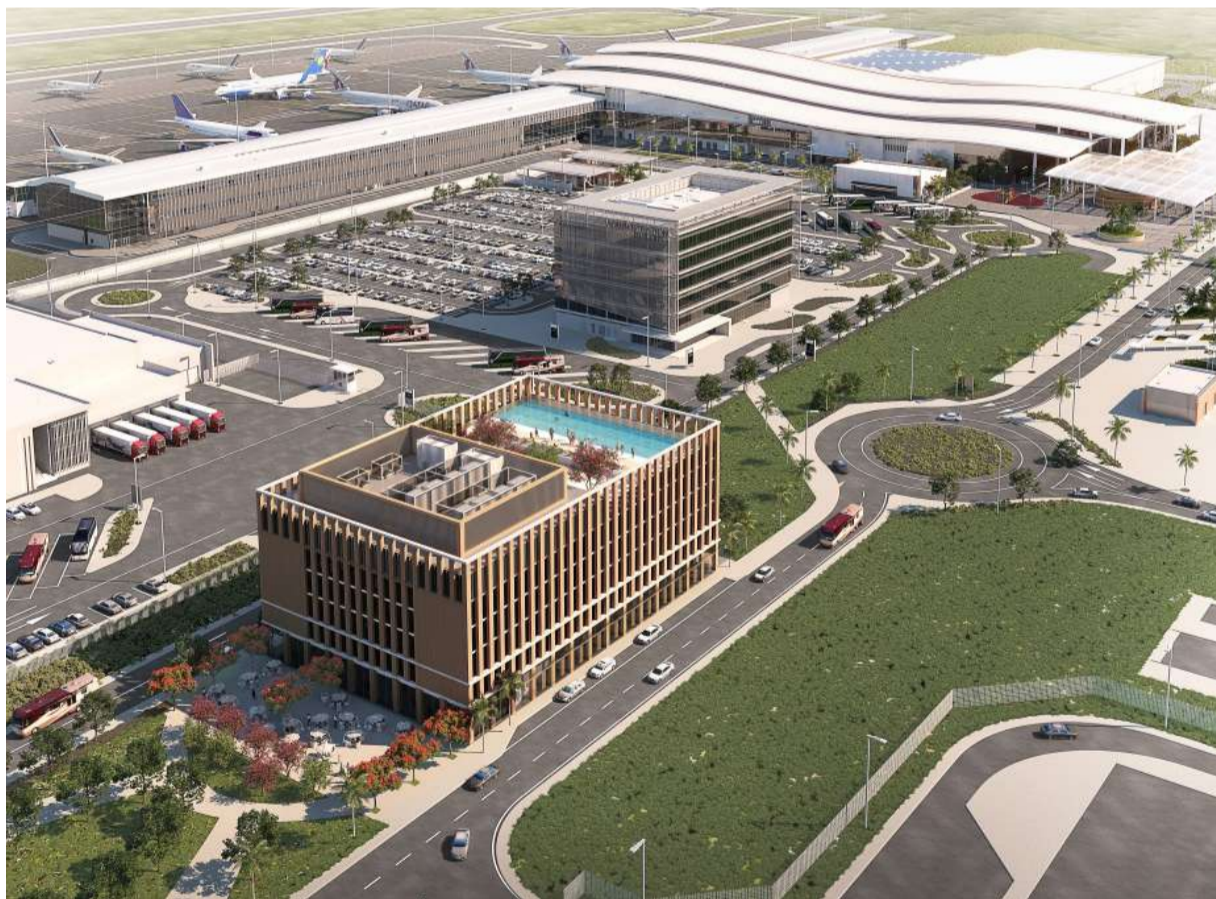
RDB ishimangira ko mu myaka umunani ishize Akarere ka Bugesera kanditse imishinga ifite agaciro ka Tiriyali zisaga 2,4 Frw

Mu Karere ka Bugesera kandi hakomeza gushyirwa imbaraga mu buhinzi bugezweho no kuhira imyaka, ubworozi n'ibindi bikorwa biyanyane no guhangana n'amapfa, hagamijwe kongera umusaruro w'ubuhinzi n'ubworozi no guteza imbere inganda zibishingiyeho.