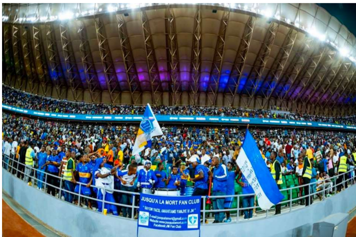
Kuri Rayon Sports Day, iyi kipe yerekana abakinnyi n'abatoza iba igiye gukoresha mu mwaka w'imikino mushya