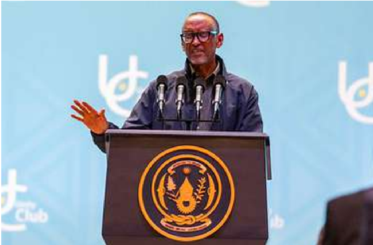
Perezida Paul Kagame yibukije abitabiriyi inama ya Unity Club ko amateka atagenwa uko abantu babyishakiye

kubera ibimenyetso cyangwa se harimo n'ibyo bimenyetso, abantu bamwe biyemerera bati ibi ni byo, ibivugwa ni byo, ibyo navuzweho ni byo, Nyir'ubwite iyo