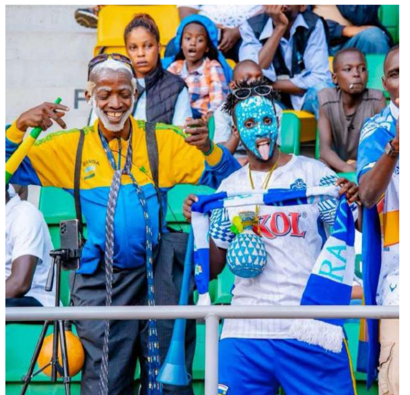
Abakunzi ba Rayon Sports bazahurira muri Stade Amahoro ku wa 18 Nyakanga

Mu mwaka ushize wa 2025, ubwo habaga uyu Munsi w'Igikundiro, Rayon Sports yatsinzwe na Yanga SC yo muri Tanzania ibitego 3-1 mu mukino wa gishuti wabereye kuri Stade Amahoro.