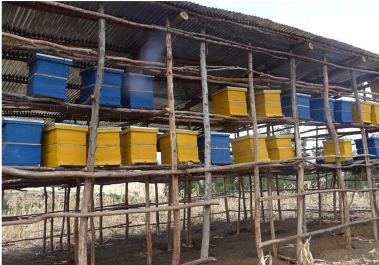
Abavumvu bafite imizinga ya kijyambere igera kuri 60%