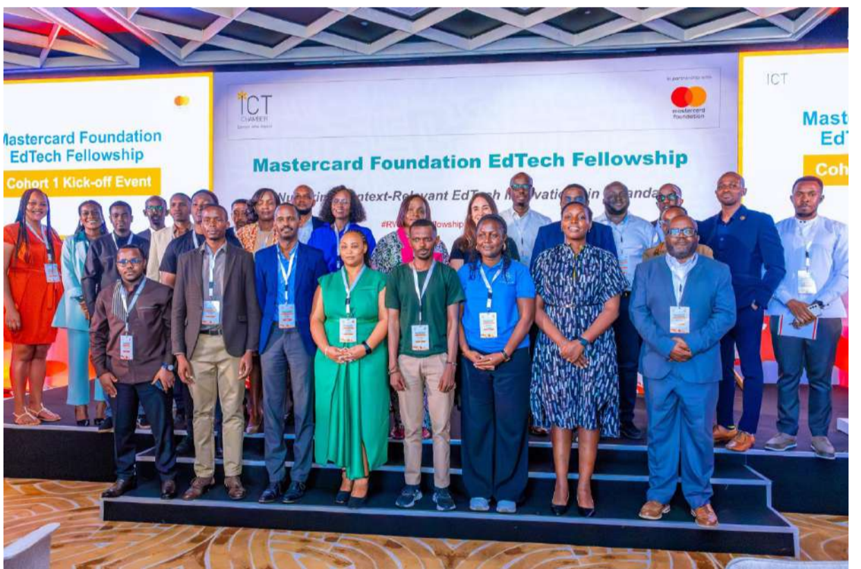
Biteganyijwe ko abasaga 40 000 barimo abanyeshuri, abarimu n’abandi bakeneye ubumenyi bw’ikoranabuhanga mu burezi bazahugurwa

Ati: “Nk’abantu dutanga urubuga ku rubyiruko ngo bimenyereze imyuga barimo biciye mu ikoranabuhanga bakiri ku ishuri, ikintu gikomeye tuzakuramo ni ukubona abo twigisha mu buryo bworoshye kuko bizatworohera gukorana n’ibigo by’amashuri binadufashe kugeza serivise zacu ku bantu benshi mu gihe gito.”