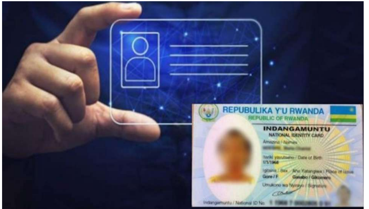
Kwiyandikisha muri gahunda y’indangamuntu Koranabuhanga (e-Indangamuntu) byarenze 90%