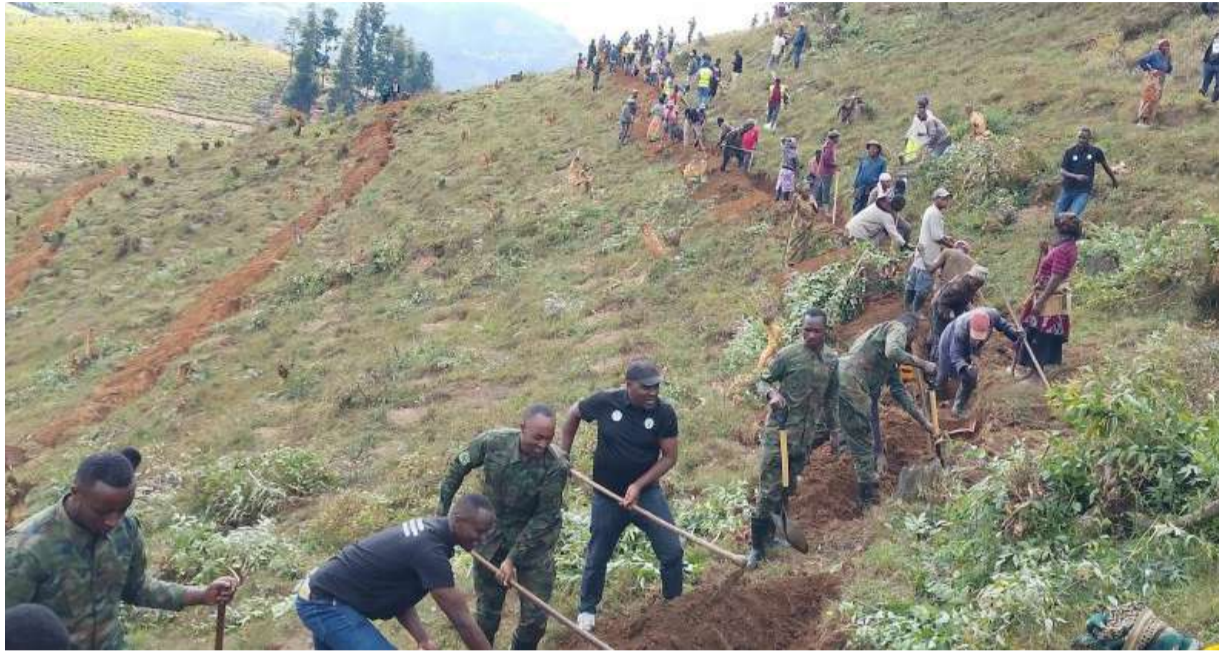
Abaturage n'Ingabo z'u Rwanda bafatanyije gucukura imirwanyasuri