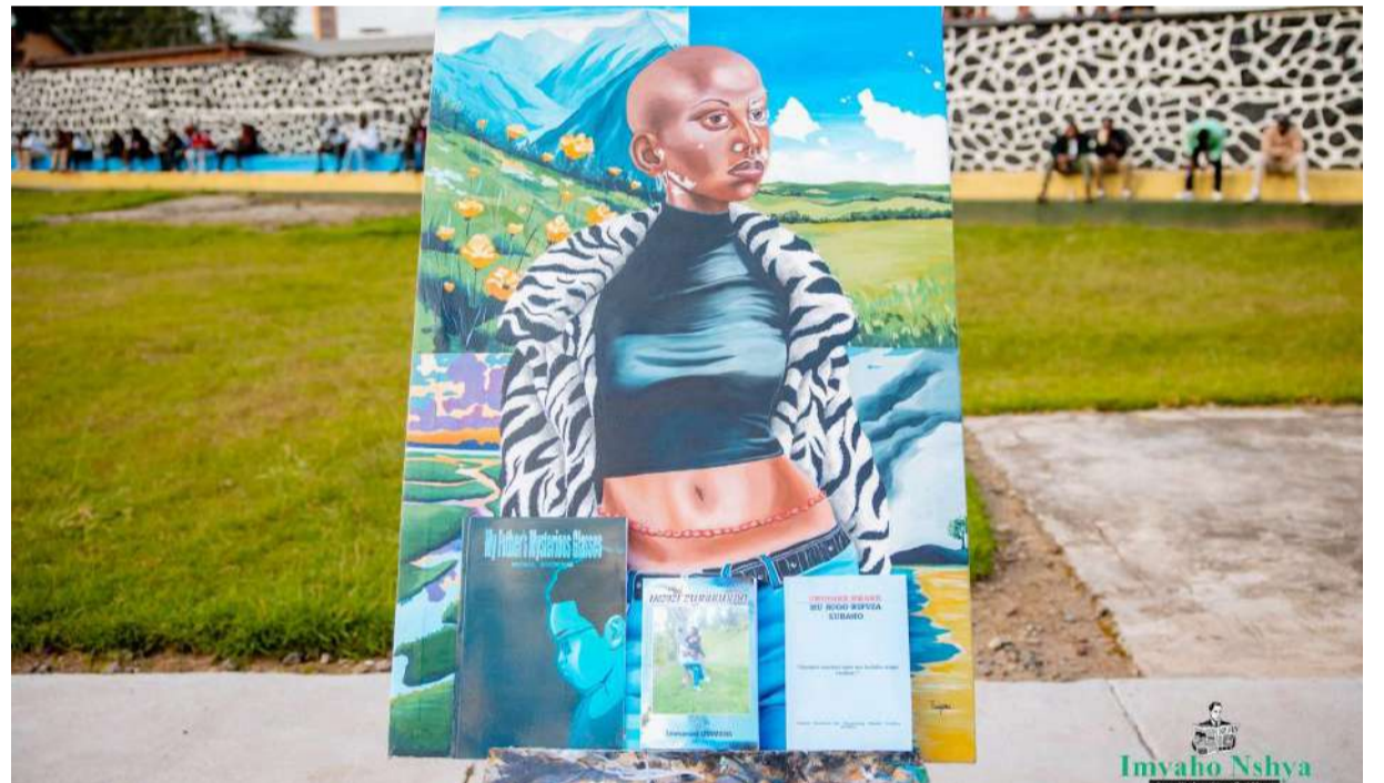
Abanyempano biganjemo abanyabugeni, abanditsi n'ababyinnyi bishimiye umwanya bahawe muri icyo gitaramo