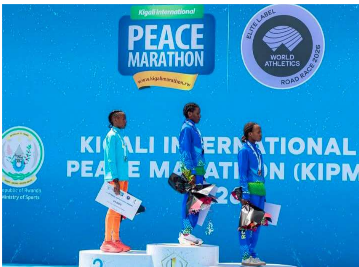
Abakinnyi bahize abandi muri Full Marathon mu Bagore

Kigali International Peace Marathon uyu mwaka yatumiwemo abakinnyi 22 bakina amarushanwa yo ku rwego rwa kabiri [Gold Label] kugira ngo izazamurirwe urwego.