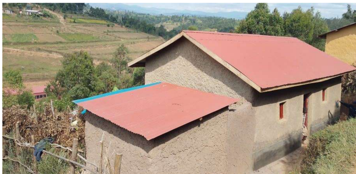
Niyonizeye yishimira ko abonye aho arambika umusaya n'urubyaro rwe