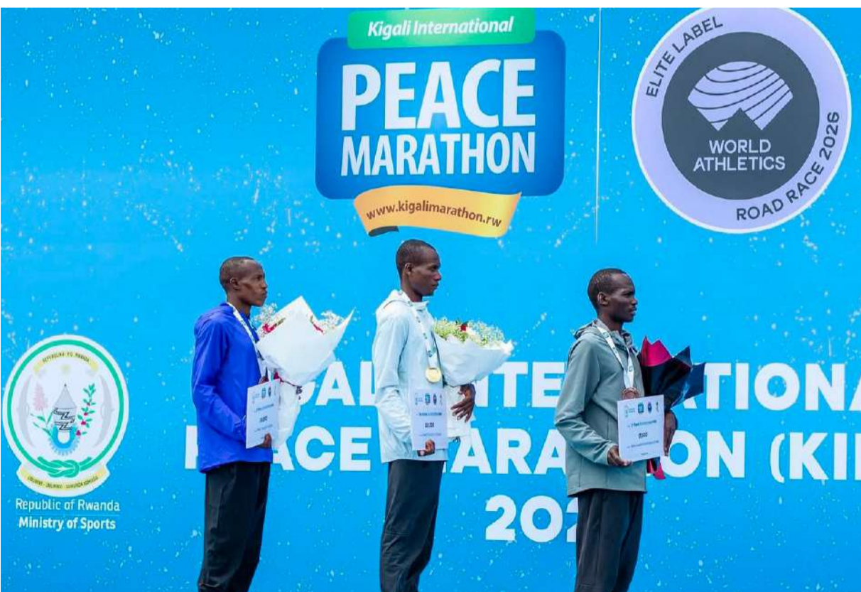
Abakinnyi bitwaye neza muri Full Marathon mu bagabo