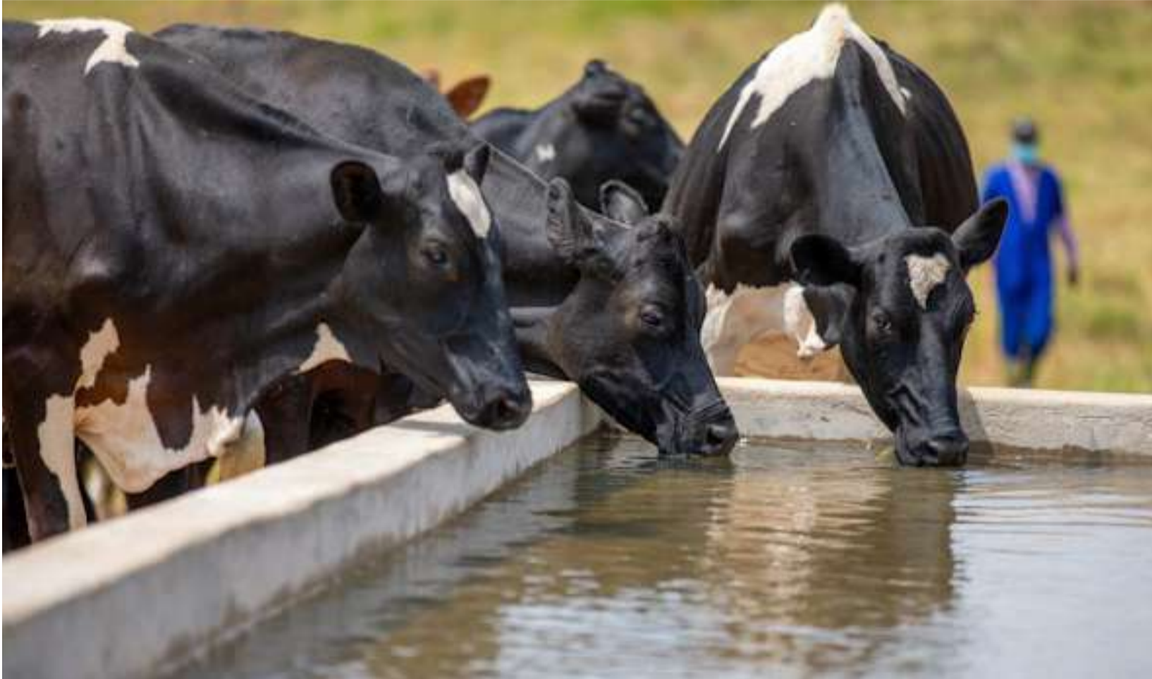
Abakoraga ingendo ndende bajya kuhira kure, bagiye guhabwa uburyo bubegereza amazi mu nzuri zabo