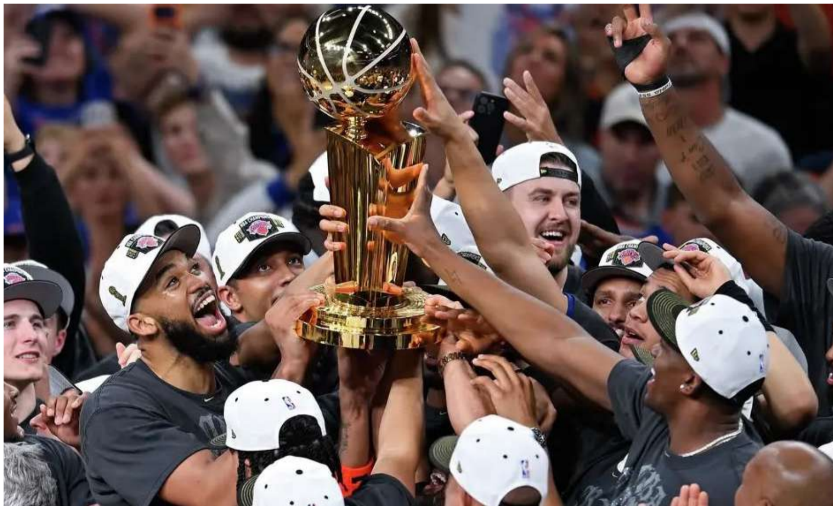
New York Knicks yitwaye neza yegukanye Igikombe cya NBA nyuma y'imyaka 53