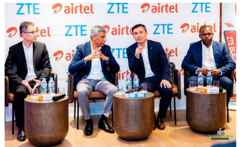
Airtel Rwanda na ZTE basinyanye amasezerano y'imikoranire