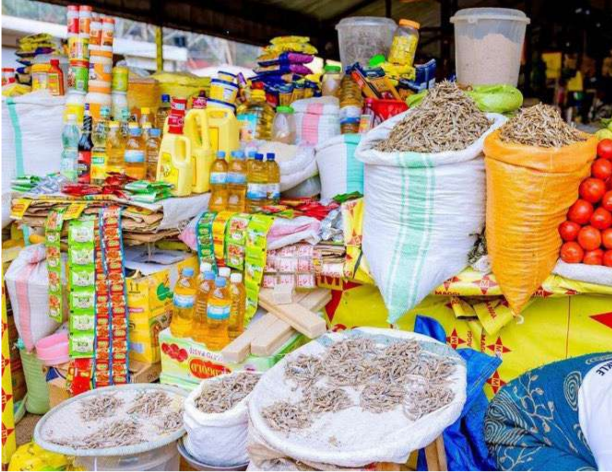
Ibiciro ku isoko mu mijyi no mu byaro, byiyongereyeho 12,3% muri Gicurasi 2026