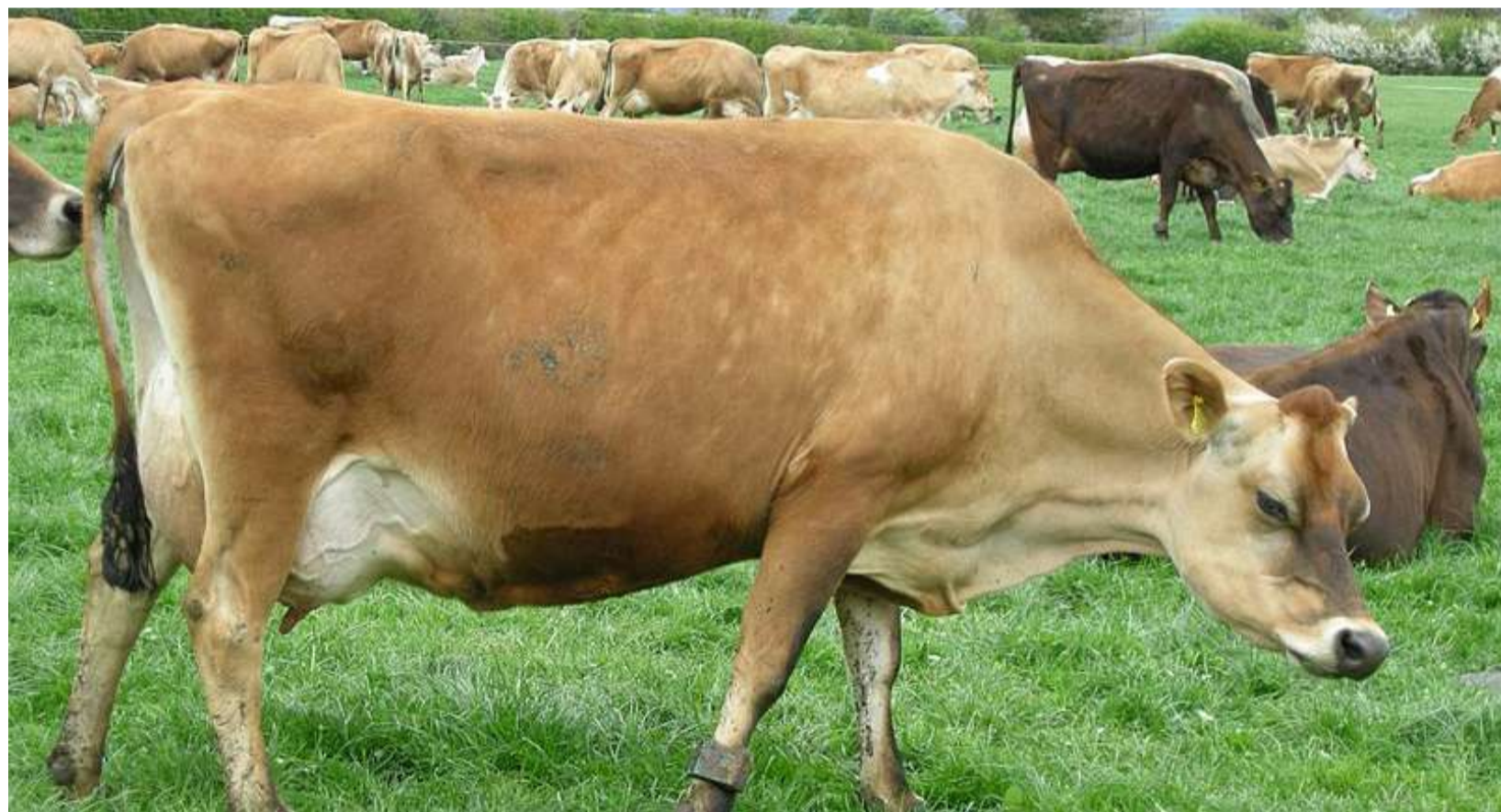
Inka irishirije hafi ikabona amazi hafi irushaho gutanga umukamo