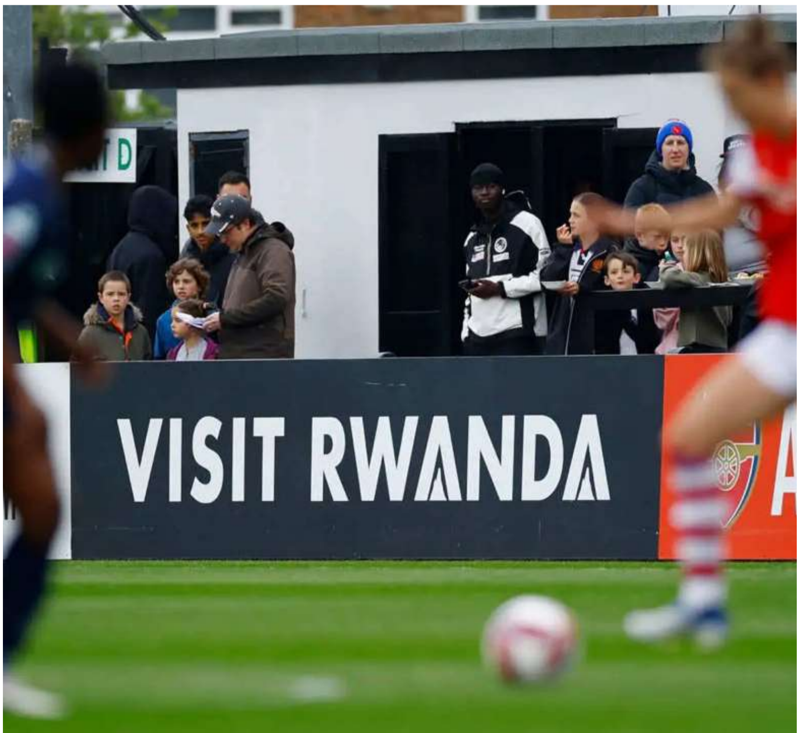
Hatangiye gushakwa ibigo by'ubucuruzi bishobora kwamamaza gahunda ya Visit Rwanda mu bihugu bitandukanye i Burayi no muri Amerika

Aya mafaranga yiyongereyeho miliyoni 38 z'amadolari ugereranyije na miliyoni 647 z'amadolari yinjijwe mu mwaka wa 2024.