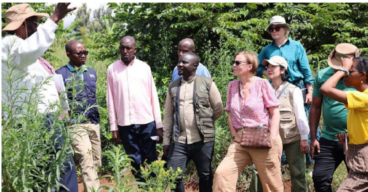
Ahibasirwaga n'izuba ubu haratoshye kubera uburyo bwashyizweho bwo kongera ibiti n'amashyamba