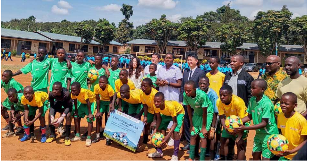
MINEDUC ku bufatanye na Ambasade y'u Bushinwa na Alibaba Group, bahaye ibigo by'amashuri 114 ibikoresho bya siporo

Mu 2023, Abanyarwanda barenga 3 500 basuye u Bushinwa, uyu mubare mu 2025 ukaba wariyongereye barenga 7 000.