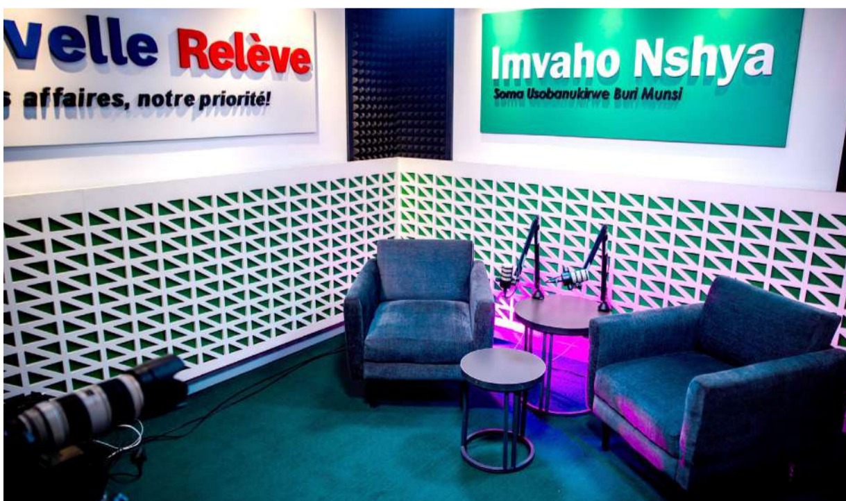
Hubatswe icyumba cya 'Podcast Studio' kijyanye n'igihe, kizafasha 'Imvaho Nshya' na 'La Nouvelle Relève' gutangaza amakuru mu buryo bugezweho

itangazamakuru rigezweho kandi ry'umwuga.