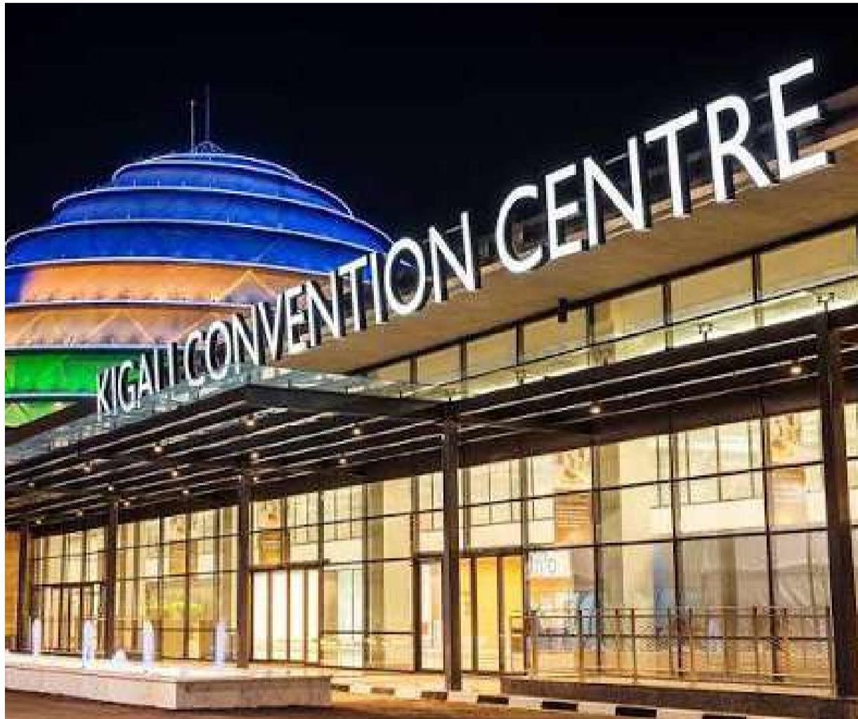
Biteganyijwe ko Inama ya 4 y'Urwego Nyafurika ku kurengera uburenganzira bwa muntu no gukumira iyicarubozo izabera i Kigali