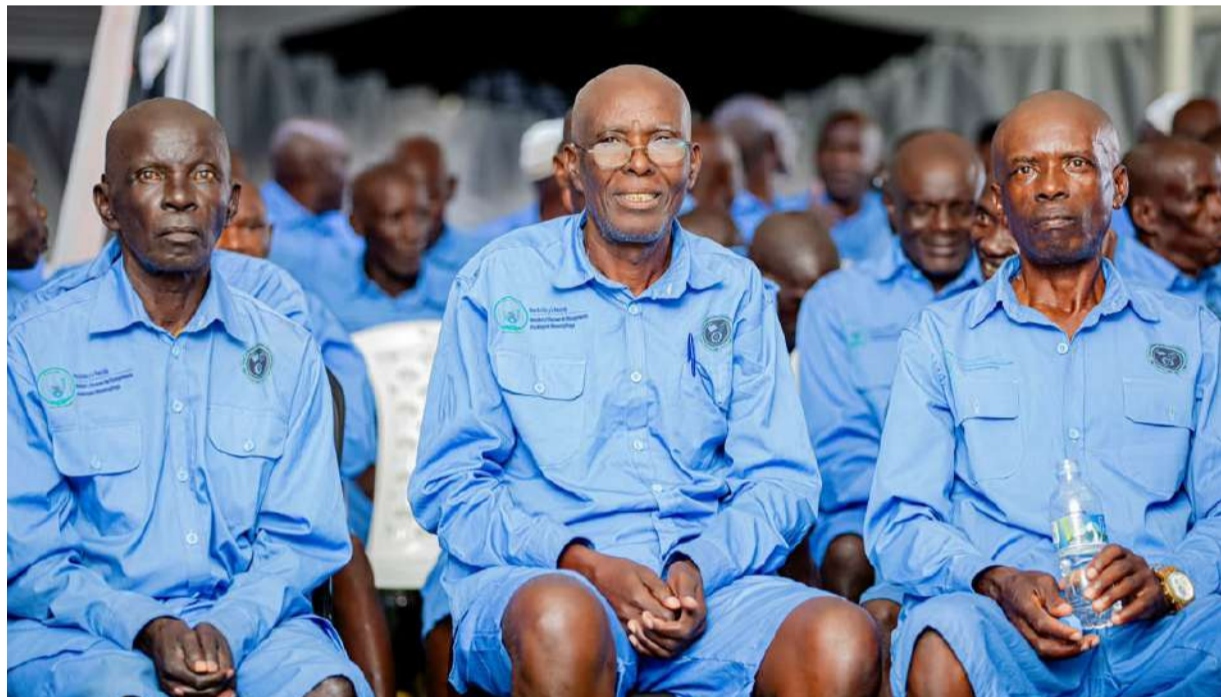
Abasoje igihano biyemeje kujya muri sosiyete bakagira uruhare mu iterambere ry'umuryango n'Igihugu