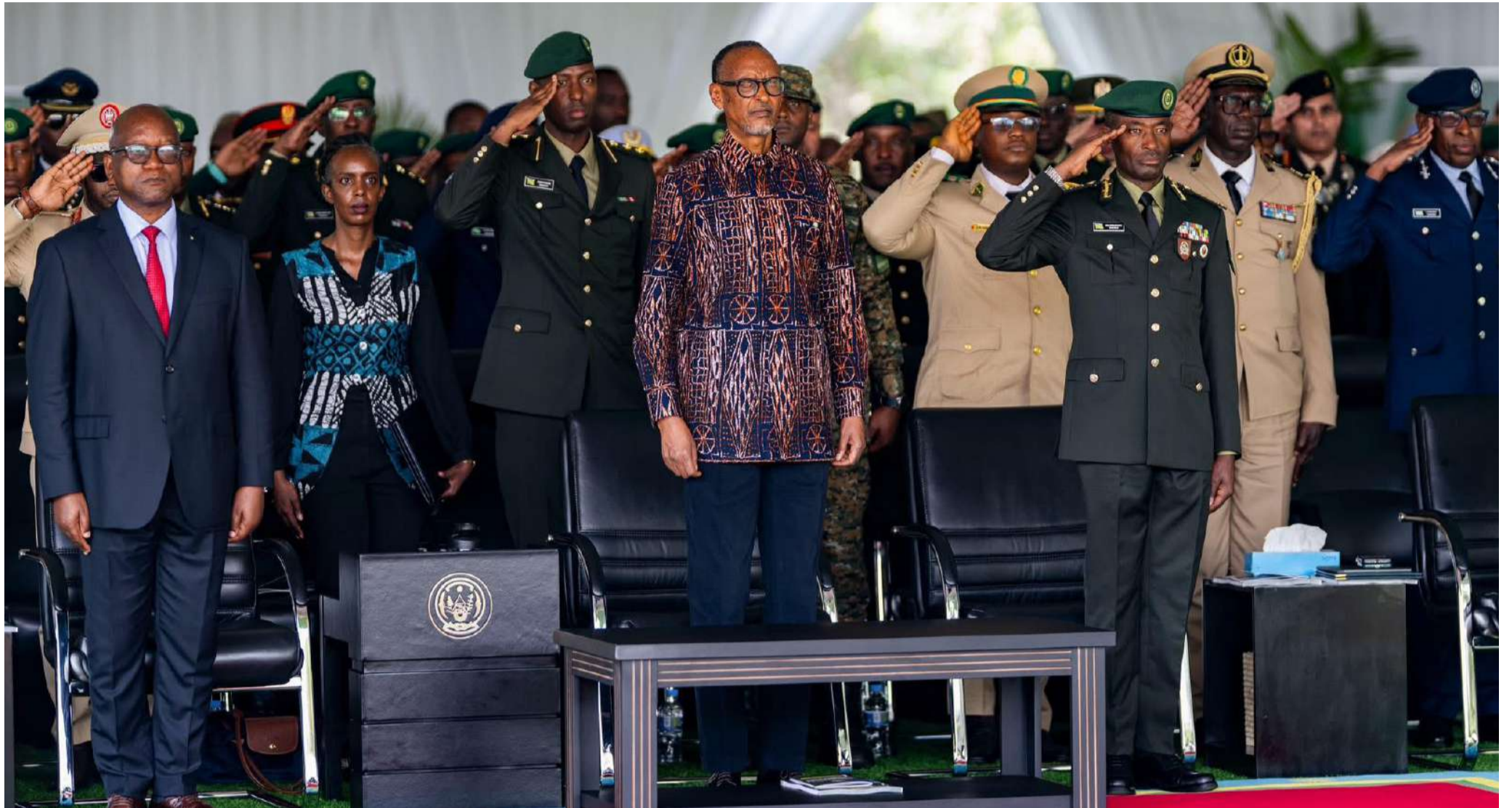
Perezida wa Repubulika akaba n'Umugaba w'Ikirenga w'Ingabo z'u Rwanda (RDF), Paul Kagame yahishuye ba Ofisiye imico 3 igomba kubaranga