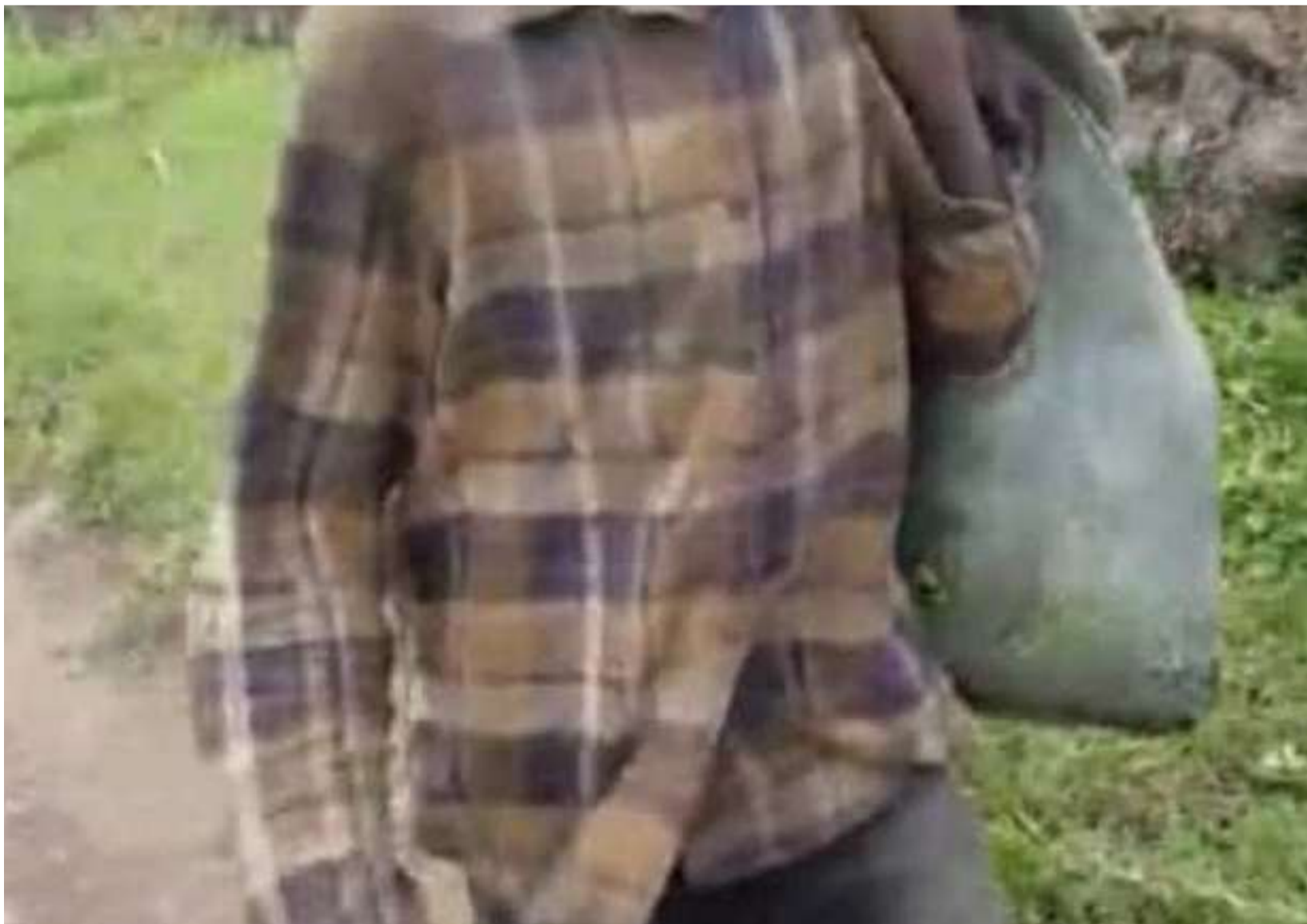
Rubavu abana bata ishuri bakajya mu bushumba bakurikiye ifaranga

Abaturage bo mu Murenge wa Rubavu bavuga ko kurwanya ikibazo cy'abana bata ishuri bakajya mu bushumba bisaba ubufatanye bw'ababyeyi, ubuyobozi n'aborozi, kugira ngo abana bose bahabwe amahirwe angana yo kwiga no kubaka ejo hazaza habo.