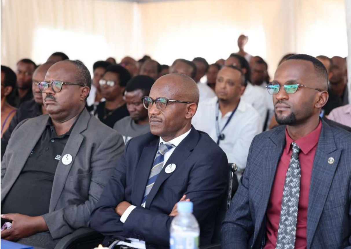
Ubuyobozi bw'ibitaro CHUK bwiyeje kurwanya ivangura iryo ari ryo ryose kandi u Rwanda rwimakaje gusigasira ubuzima