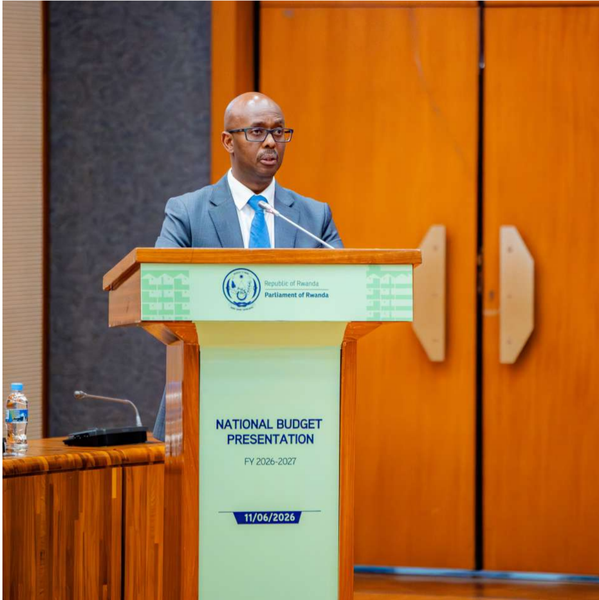
Minisitiri w'Imari n'Igenamigambi, Yusuf Murangwa, yijeje ko Guverinoma y'u Rwanda izakomeza kongera umusaruro w'ubuhinzi