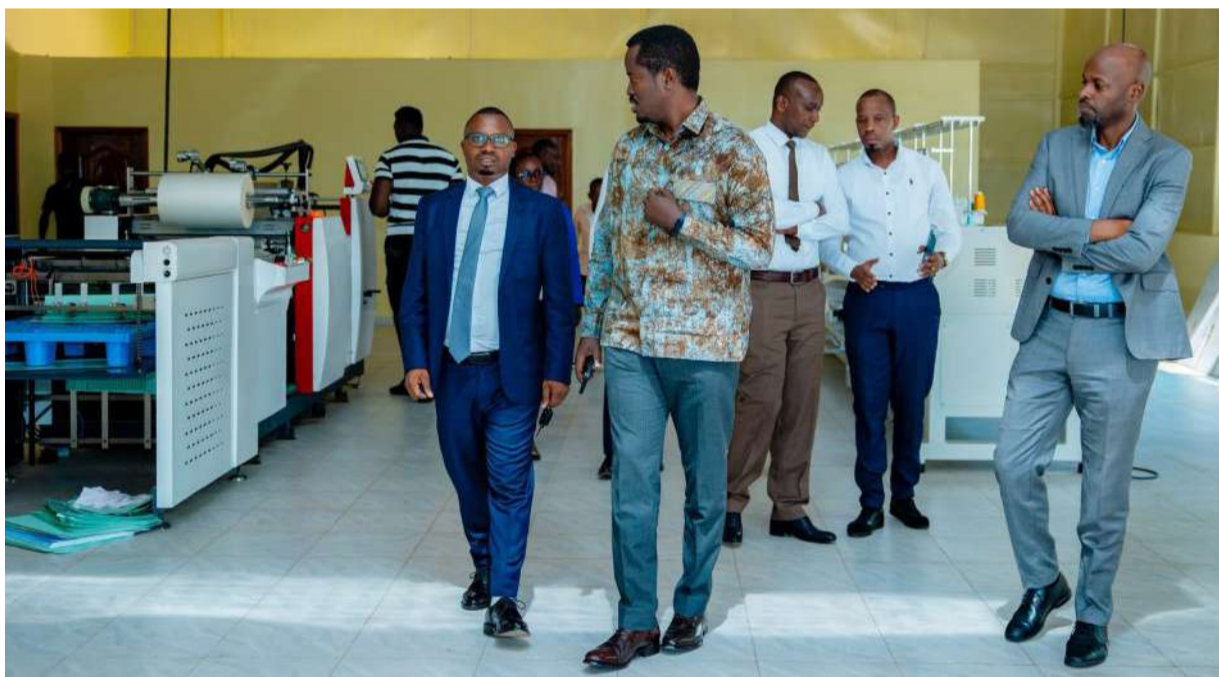
Havuguruwe kandi hanagurwa ibikoresho bishya bigezweho mu kurushaho kunoza serivisi z'icapiro