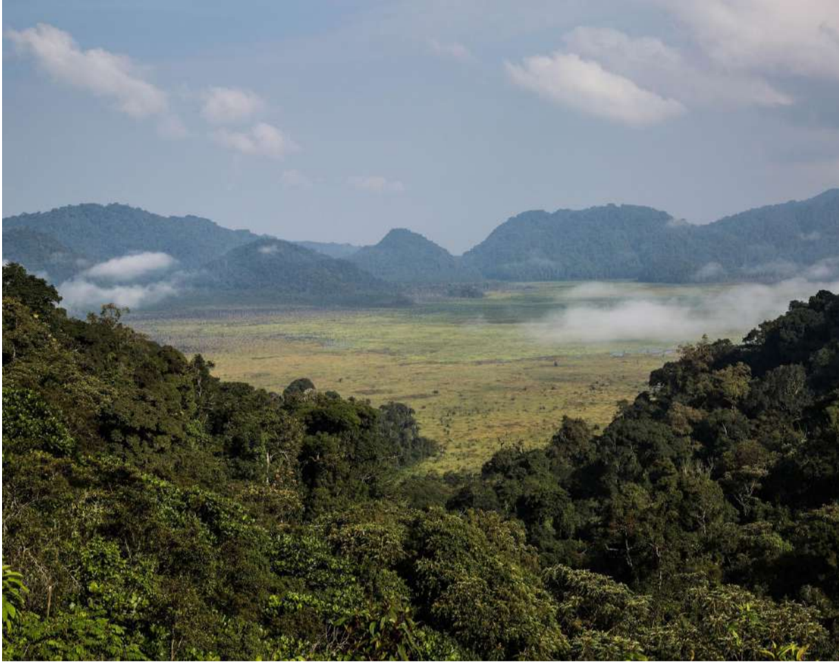
Abaturiyeye Pariki y'Igihugu ya Nyungwe bagirwa inama yo kuyibungabunga kuko ibyiza biyiturukamo bibageraho