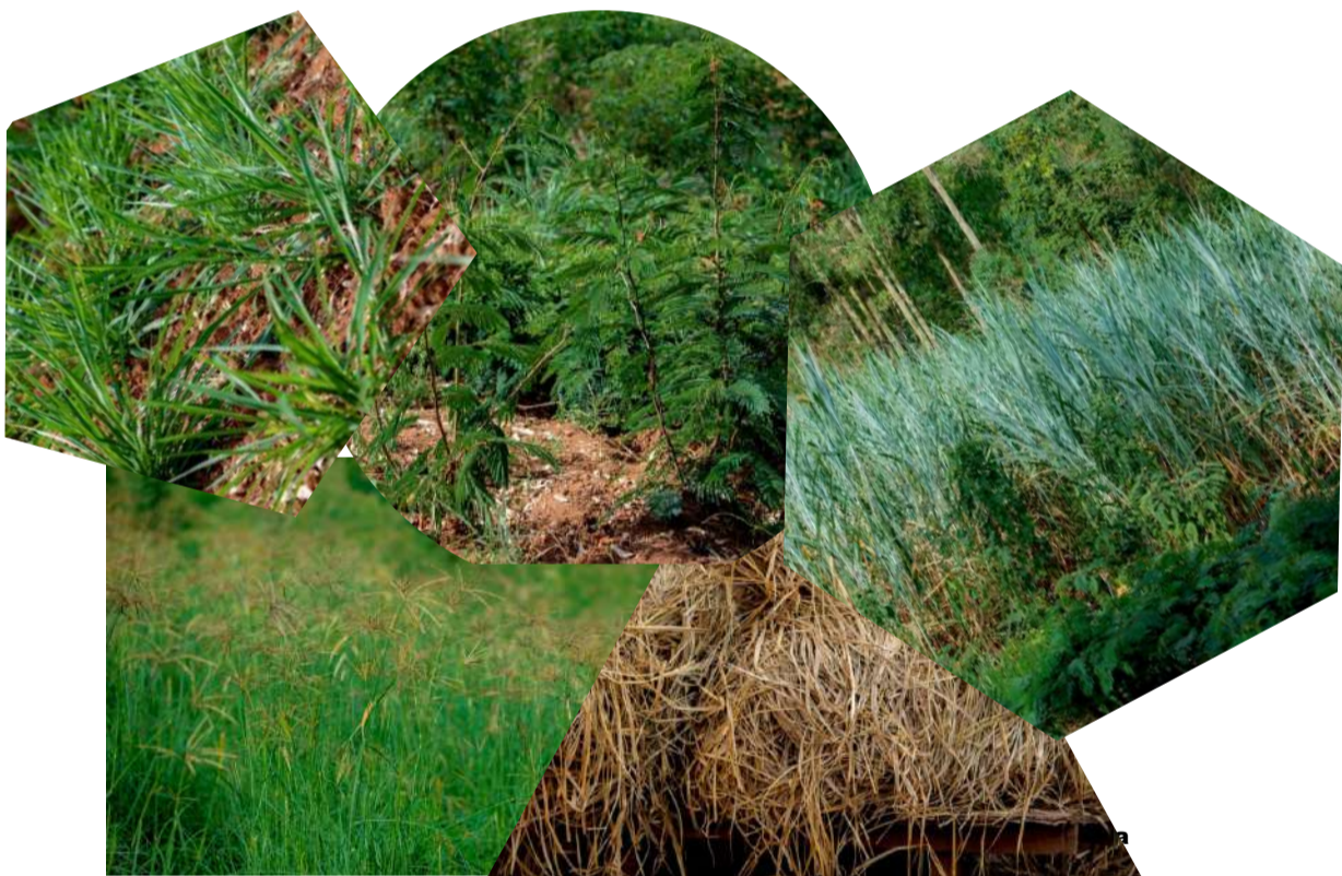
Ubwatsi butandukanye bufasha kunoza imirire, umukamo ukuyongera