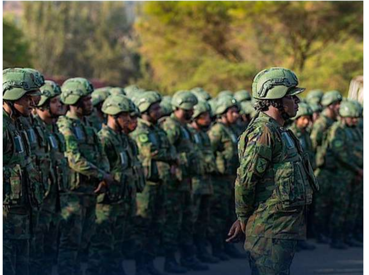
U Rwanda rwamaganye Umuryango Human Rights Watch (HRW) ibogamye ishinja ibinyoma Ingabo z'u Rwanda