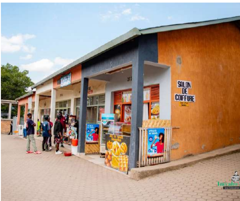
Abacuruzi i Musanze bavugako igitaramo cya Summer country tour cyabasigiye agatubutse