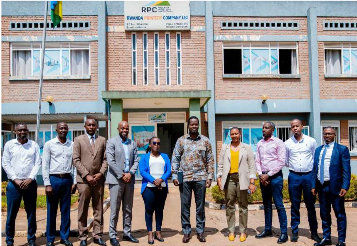
Abagize Inama y'Ubutegetsi ya RPC, Umuyobozi Mukuru wa 'Agaciro Development Fund', Umuyobozi Mukuru wa RPC n'Abayobozi b'amashami abarizwa muri RPC