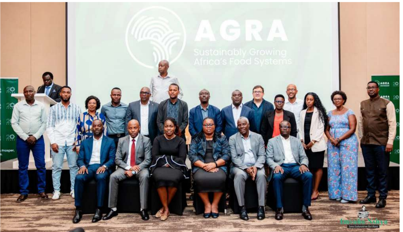
Abayobozi n'abashakashatsi baganiriye ku buryo bwo guteza imbere ubutubuzi bw'imbutu nziza

rukomeye mu bukungu mpuzamahanga bw'imbutu, tugomba gukomeza kubaka inzego zikomeye, kuvugurura amategeko n'amabwiriza, kwihutisha udushya no kubaka sisiteme z'imbutu zizewe ku rwego mpuzamahanga."