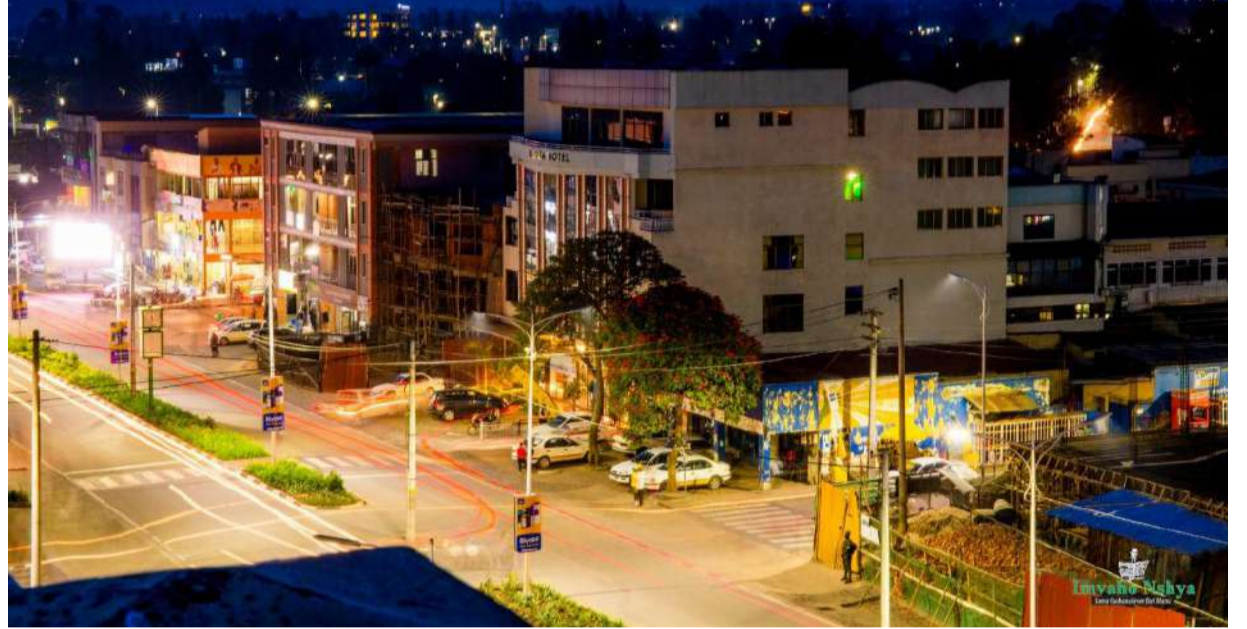
Abacuruzi i Musanze bavugako igitaramo cya Summer country tour cyabasigiye agatubutse

Ubwu baganiraga n'itangazamakuru, abateguye icyo gitaramo batangaje ko hateganyijwe gutanga akazi ku rubyiruko rurenga 2 000 mu Turere bizaberamo.