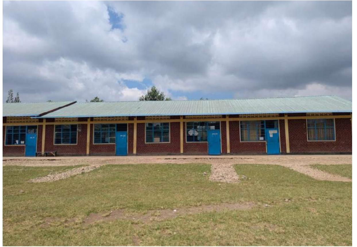
Inyubako nshya z'amashuri ubwo zari zimaze kuzura