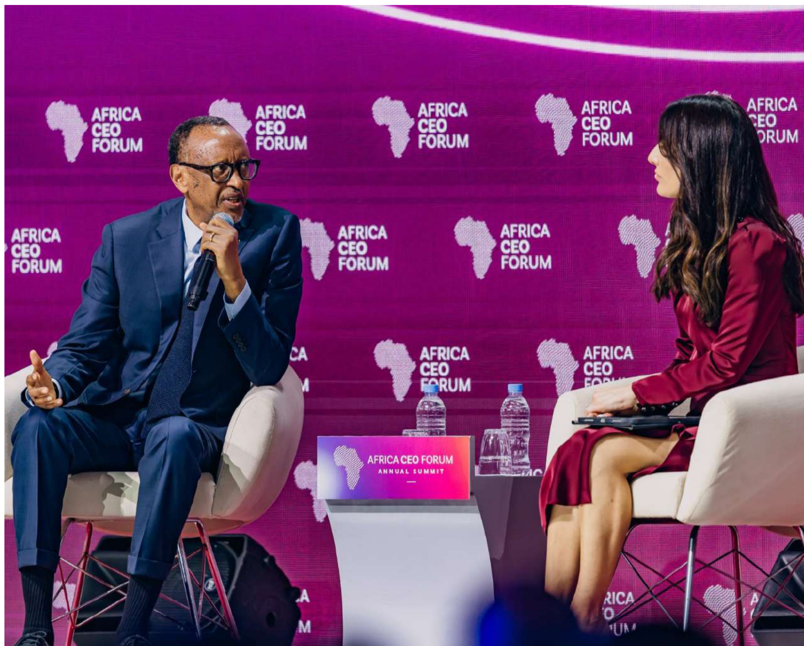
Perezida Kagame yashimangiye ko ibihugu by'afurika bigomba kwihesha agaciro kandi ntibiterwe ubwoba n'ibihano bifatirwa n'ibikomeye bishaka gusahura imitungo