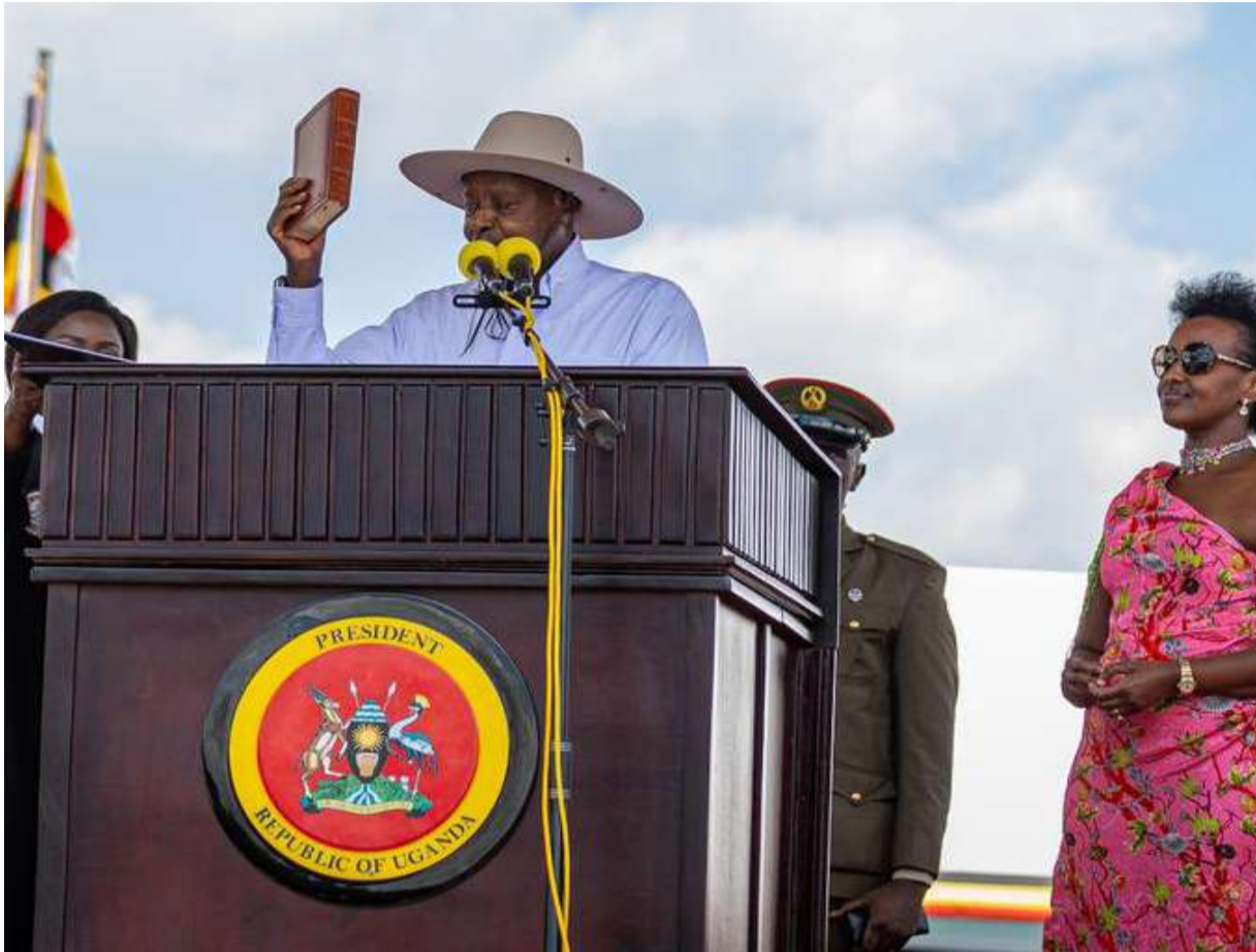
Perezida wa Uganda, Yoweri Kaguta Museveni yarahiriye kongera kuyobora icyo gihugu muri Manda ya 7