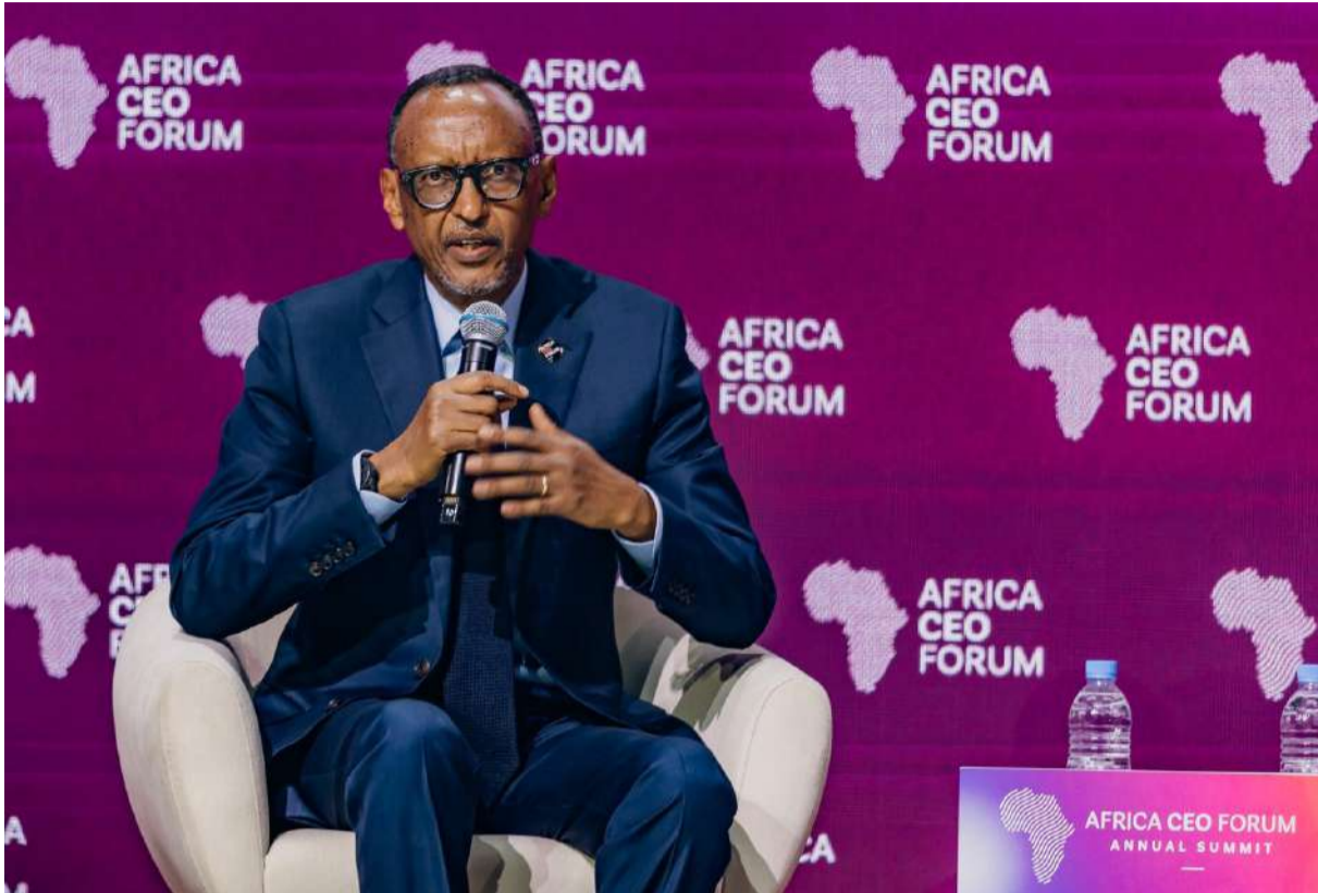
Perezida wa Repubulika y'u Rwanda Paul Kagame asanga umutungo w'Afurika uhagije kugira ngo igire iterambere rirambye