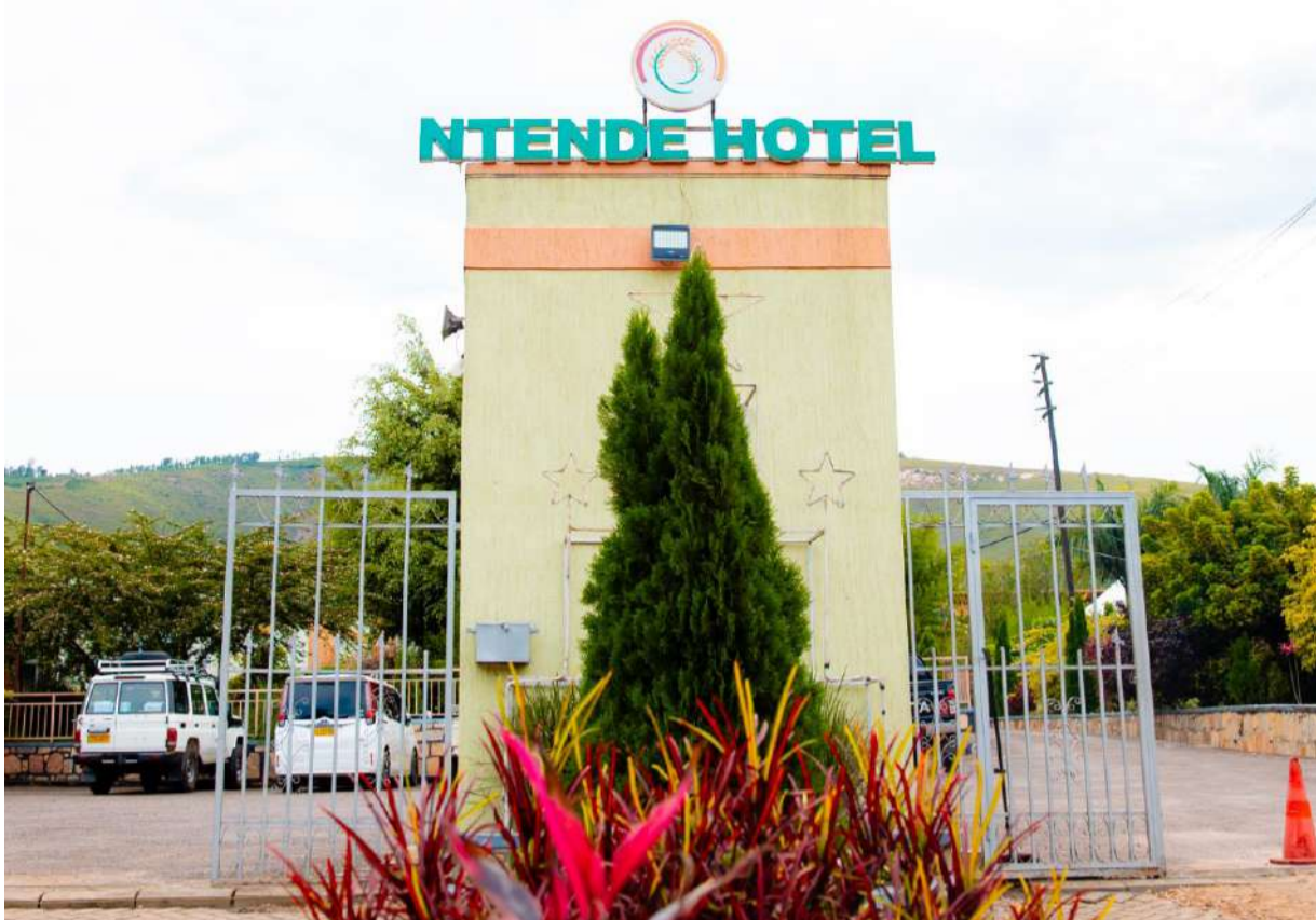
Hotel Ntende yatangiye n'Abahinzi b'umuceri mu gishanga cya Ntende mu Karere ka Gatsibo