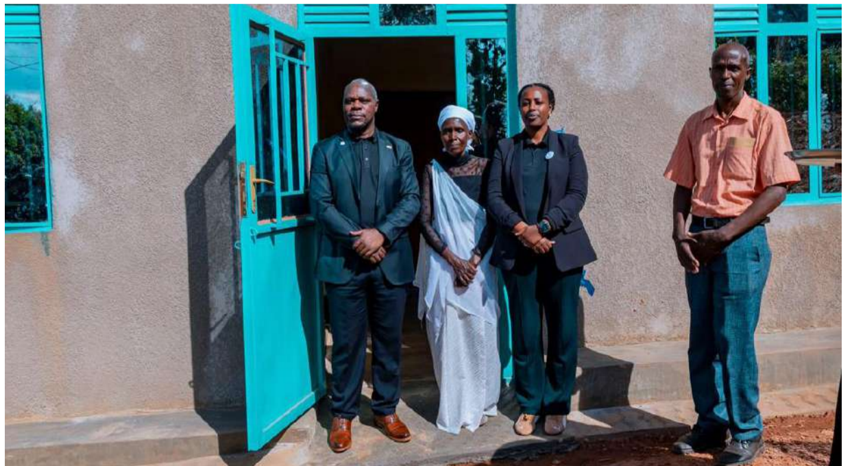
NESA yashyikirije uwarokotse Jenoside inzu yamusaniye

Basobanuriwe kandi uburyo Abatutsi bari bahahungiyeye bishwe urubozo, aho nyuma yo kubica, Interahamwe zasubiraga inyuma ngo zirebe ko bapfuye neza zigasya urusenda zikarunyanyagiza ku mibiri uwinyagambuyeye zikamunogonora. Nyuma yo kubona ko ntawusigaye zaragiye ariko zibona ishusho ya Yezu yari imanitse imbere ya Kiliziya zivuga ko nawe ari Umututsi zirayimanura zirayitemagura, nayo ni imwe mu zigaragara muri urwo Rwibutso.