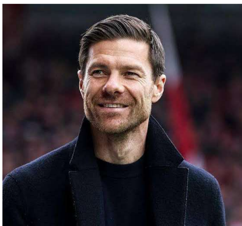
Xabi Alonso yagizwe Umutoza mushya wa Chelsea

Igikombe cya Shampiyona mu bagore cyamazwe kwegukanwa na APR WVC yatsinze Kepler WVC mu mikino itatu ya mbere ya kamarampaka.