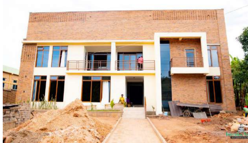
Koperative Coproriz Ntende, irimo kubaka isoko ry'umuhinzi rizajya rikora nk'irya gisirikare rizwi nka Army Shop