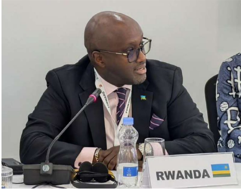
Minisitiri w'Ububanyi n'Amahanga n'Ubutwererane, Amb. Nduhungirehe yagaragaje imikorere y'Akanama ka Loni

Mu butumwa bwatangajwe n'Iburo bya Perezida wa RDC tariki ya 14 Gicurasi 2026, havuzwemo ko icyo gihugu "cyitabiriye ibiganiro,