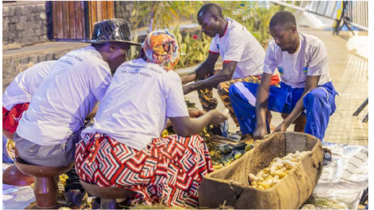
Hagaragajwe uko Abanyarwanda bengaga ibitoki