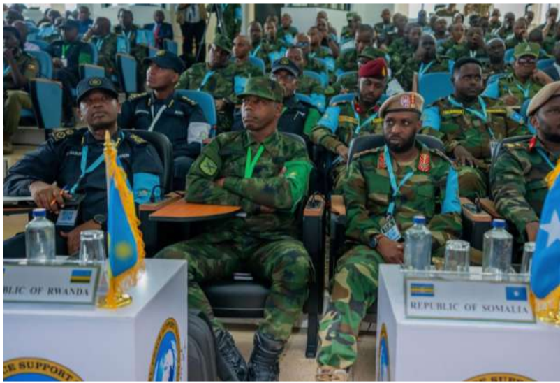
U Rwanda ruri mu bihugu byitabiriye imyitozo ya Ushirikiano Imara 2026