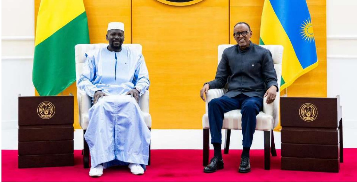
Perezida Kagame na Mamadi Doumbouya baganiriye ku ngingo z'ingenzi zirimo iterambere ry'ubukungu, ubucuruzi, ishoramari n'imiyoborere myiza

Abakuru b'Ibihugu byombi hamwe n'amatsinda yabaherekeje, baganiriye