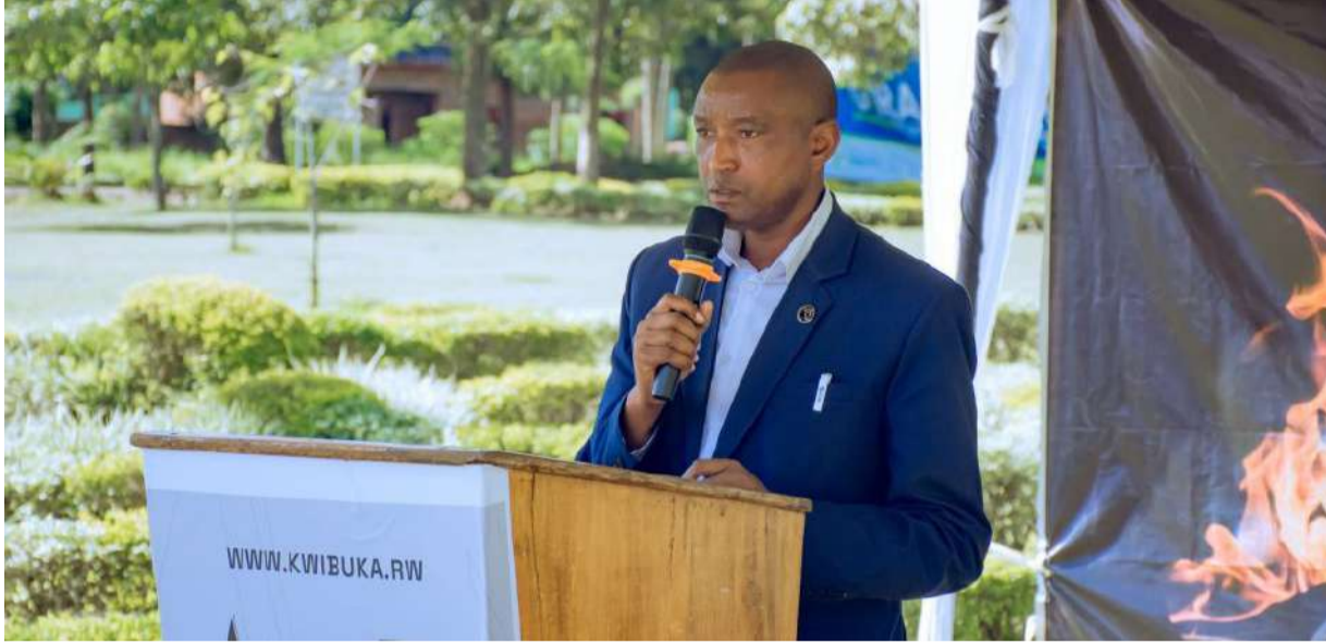
Perezida wa IBUKA mu Karere ka Nyagatare yasabye ko hashyirwa ikimenyetso cy'amateka kigaragaza abakozi bishwe muri Jenoside yakorewe Abatutsi mu 1994

Yagize ati: "Mu gihe nk'iki twibuka ku nshuro ya 32 abari abakozi