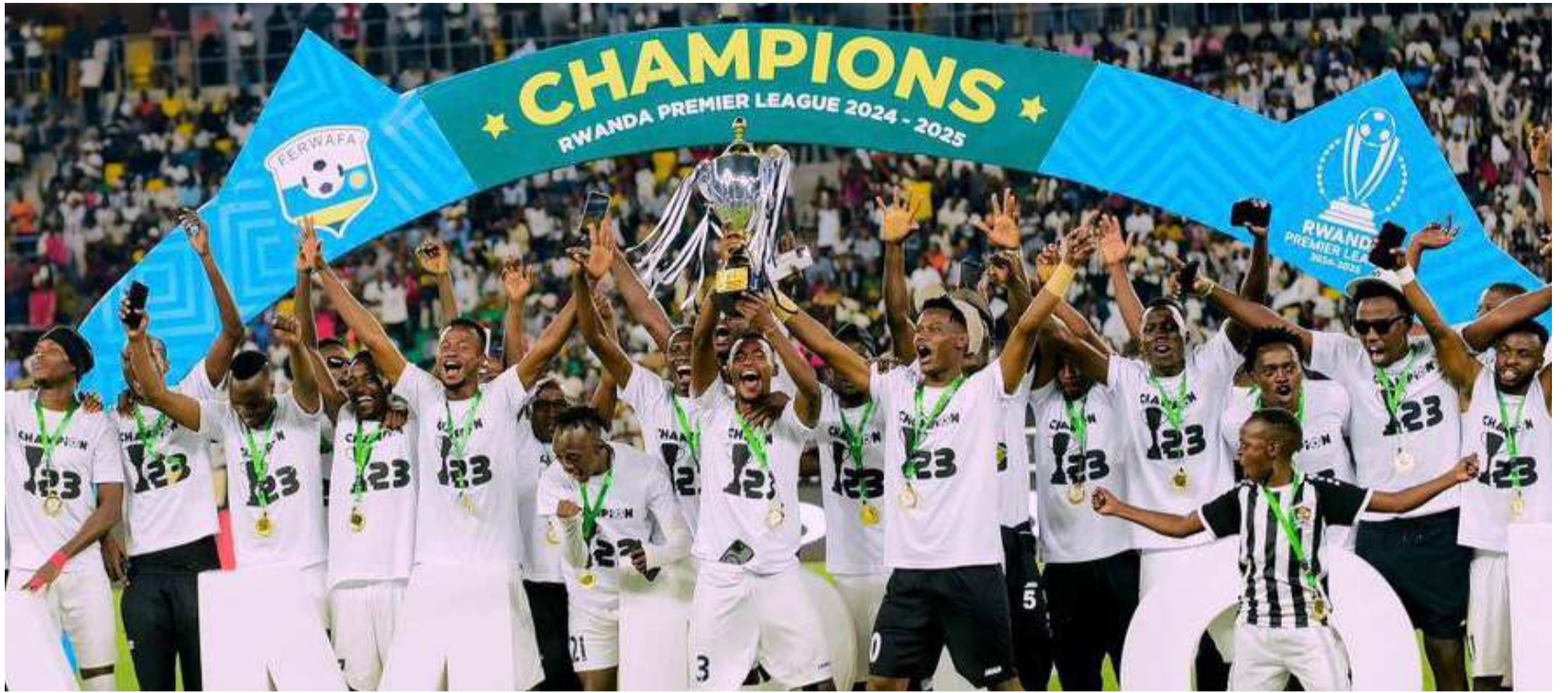
APR FC yegukanye igikombe cya Shampiyona ku nshuro ya karindwi yikurikiranya