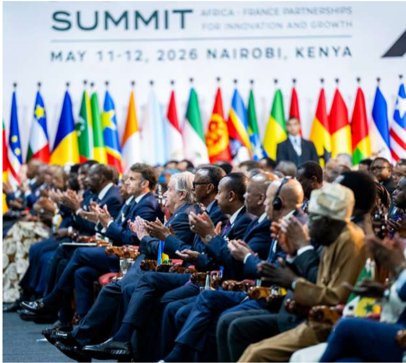
Perezida Paul Kagame yari mu Bakuru b'Ibihugu barenga 30 bitabiriye inama ya 'Africa Forward' yateraniye i Nairobi muri Kenya