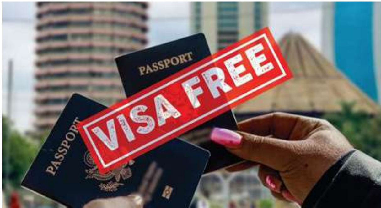
Nigeria na Botswana zakuriyeho Visa Abanyarwanda berekezayo

borohewe no gukora ingendo muri ibyo bihugu bagashaka amasoko n'abafatanyabikorwa mu bwisanzure.