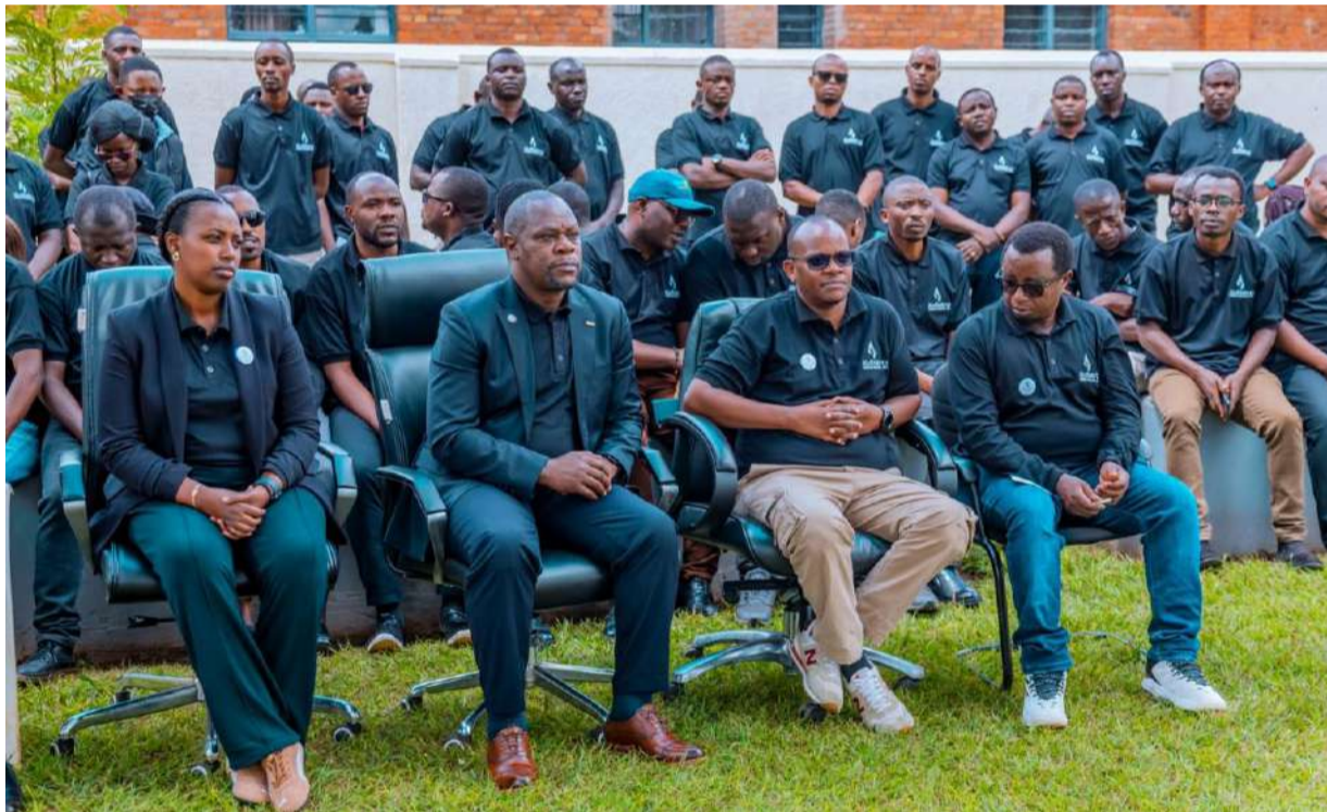
Ubuyobozi n'abakozi ba NESA basuye Urwibutso rwa Jenoside yakorewe Abatutsi rwa Nyarubuye mu Karere ka Kirehe