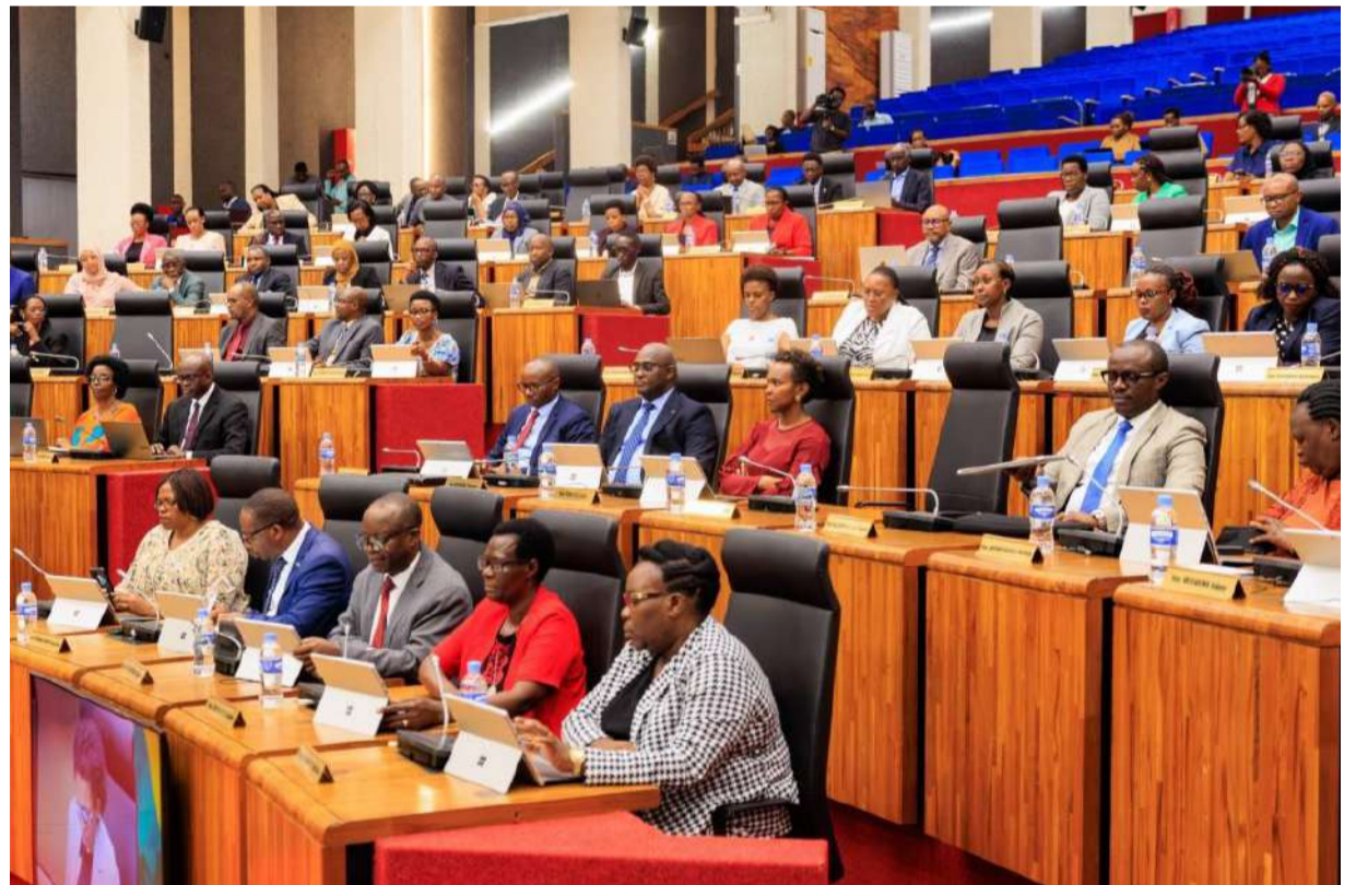
Inteko Ishinga Amategeko imitwe yombi yagejewe umushinga w'itegeko ry'ingengo y'imari y'umwaka wa 2026 - 2027