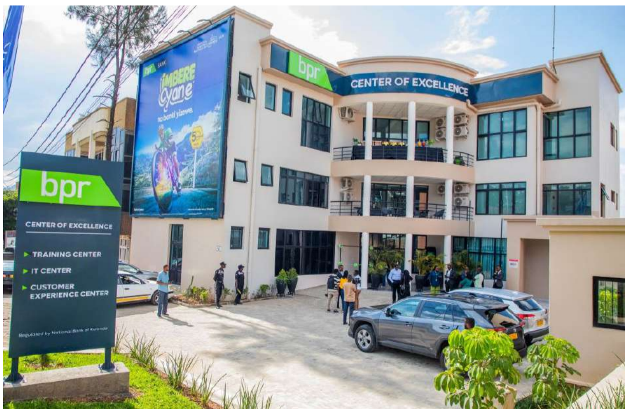
Umutungo wa BPR Bank wageze kuri Tiriari 1 na miliyari zirenga 400 z'amafaranga y'u Rwanda mu 2025