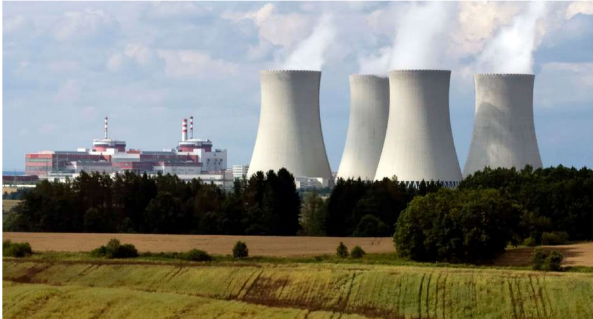
U Rwanda rubona ingufu za Nikeleyeri nk'izingiro ry'iterambere rirambye

mpuzamahanga nka Banki y'Isi, Banki Nyafurika Itsura Amajyambere (AfDB), Banki y'Ubucuruzi n'Iterambere (TDB), Banki y'Iterambere rya Afurika y'Iburasirazuba (BOAD), ibigo by'abashoramari batandukanye ndetse n'abahagarariye ibigega Mpuzamahanga.