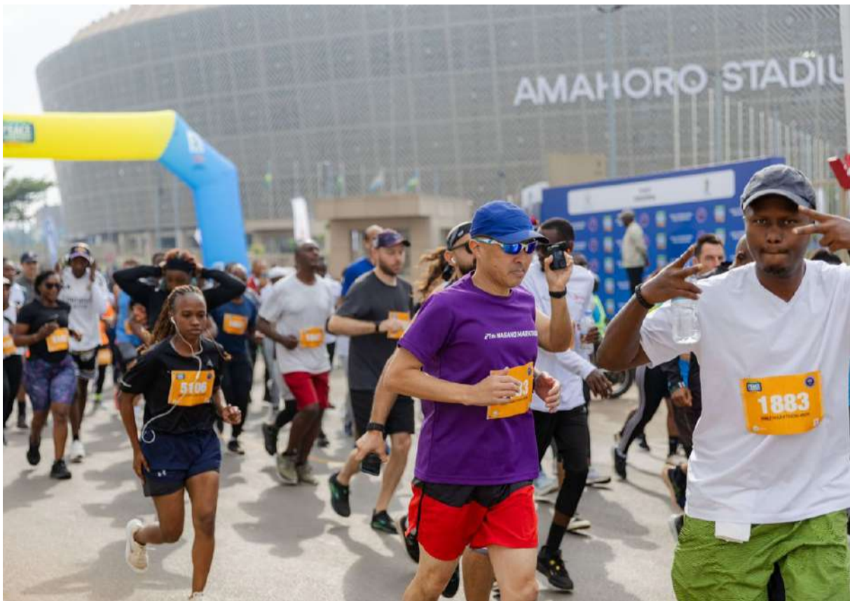
Ku nshuro ya mbere, Kigali Peace Marathon igiye gukinwa iminsi ibiri