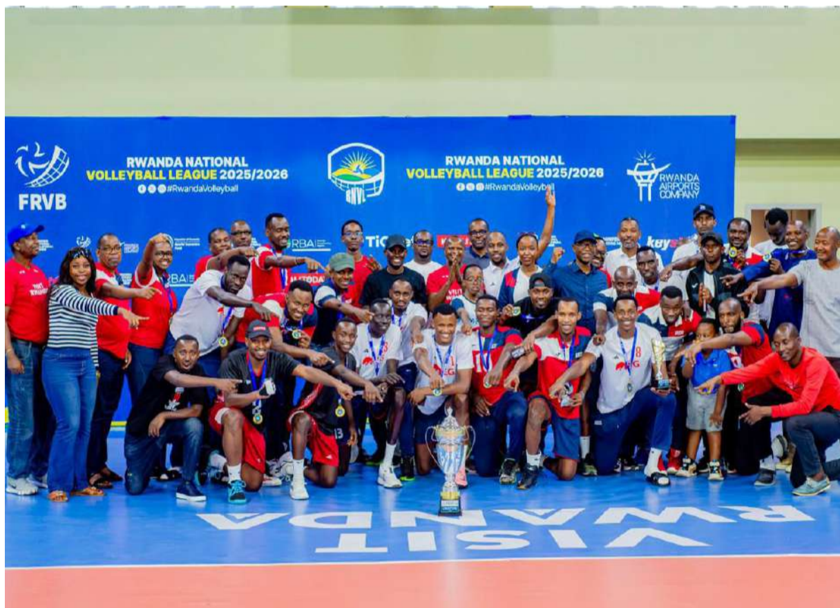
REG VC yegukanye igikombe cya Shampiyona ya 2025/26

VC yakomeje gukina neza itsinda amanota menshi, Police VC yagerageje kuyigora, ariko birangira iyi kipe ya Sosiyete y'u Rwanda ishinze ingufu iyitsinze ku manota 25-23.