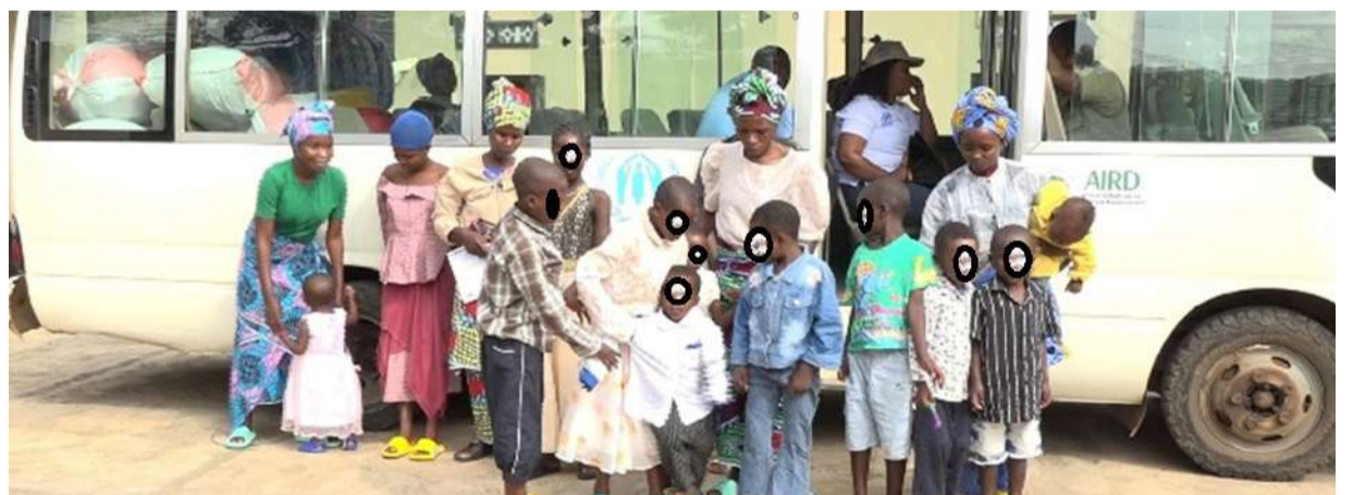
Abanyarwanda 19 bari ku mupaka wa Rusizi ya mbere bagiye kwerekeza mu nkambi y'agateganyo ya Nyarushishi