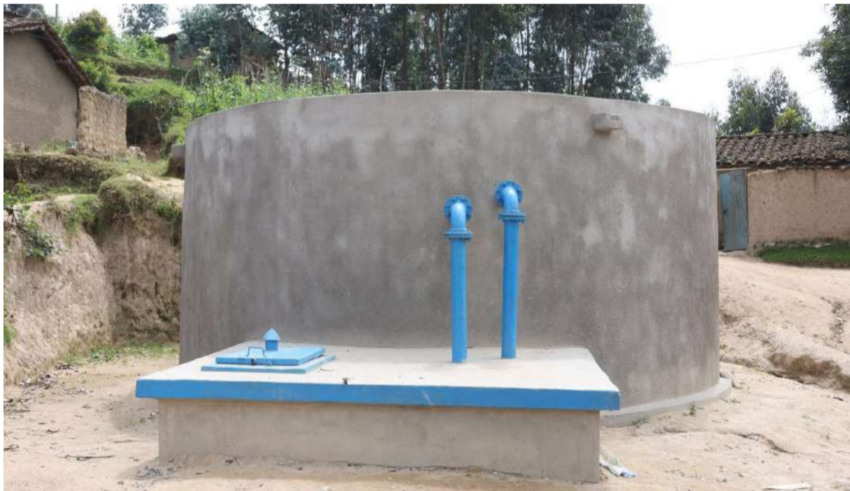
Kimwe mu bigega bifata amazi byubatswe muri Nyabihu