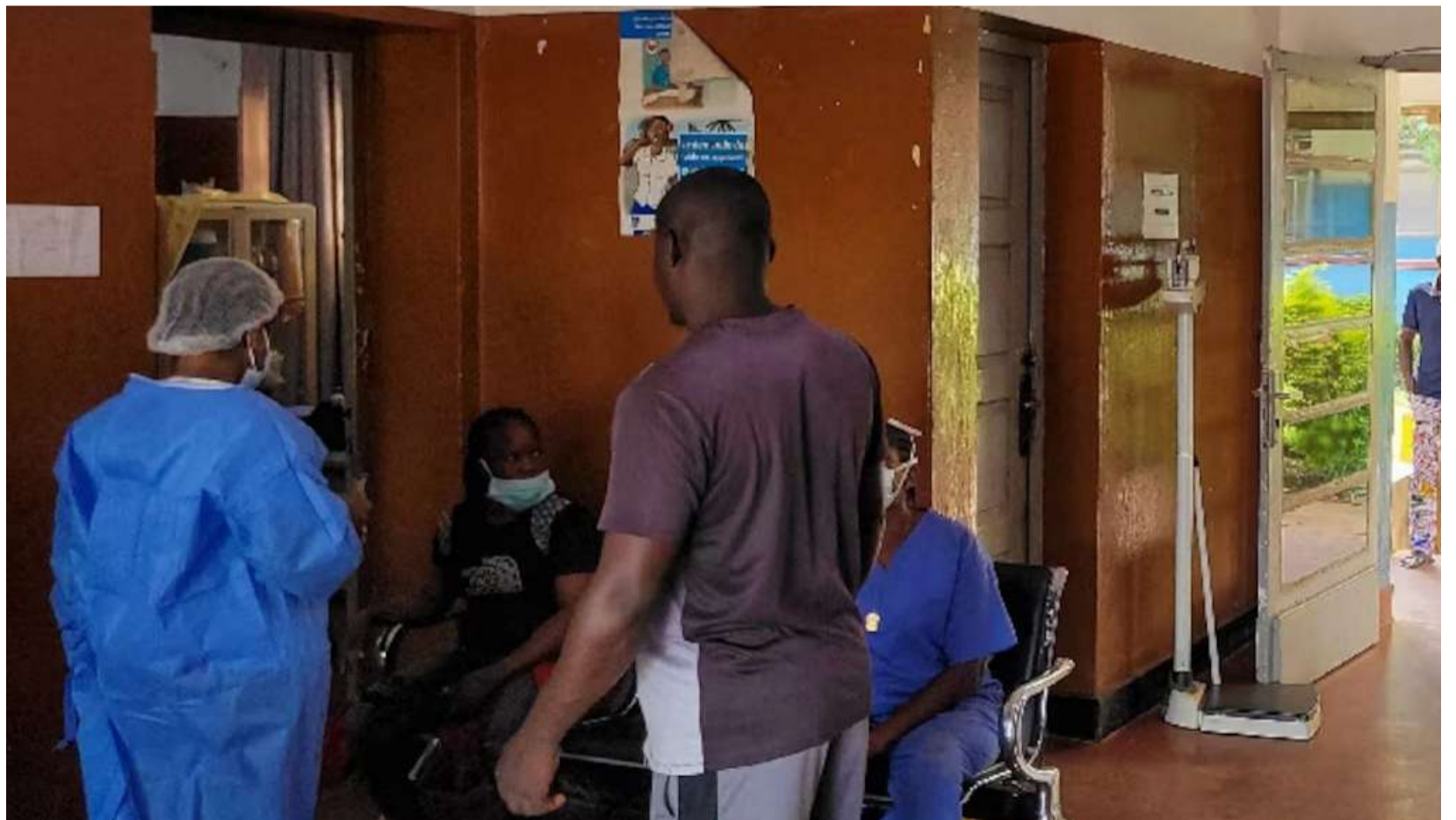
Kubera ebola yongeye kugaragara muri RDC no muri Uganda, ibihugu by'ibituranyi birasabwa kuba maso