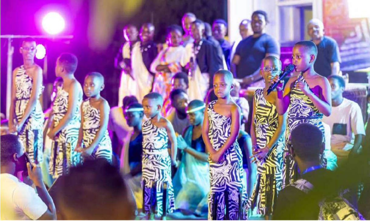
Mu kurinda umuco gucika, itorero Indatirwabahizi ritoza abana kujya mu ngamba

Ati: “Nk’umusore nari ngiye gushaka aho mfata kamwe ngo mbe nduhuka mu mutwe kuko icyumweru kiba ari cyose, nkirimo gushakisha aho njya na bo tujyana mba nyuze hano muri ‘car free zone’ nsanga hagezweho abanyamideri mbona ni byiza ndahaguma kandi nanezerewe pe ahubwo ibitaramo nk’ibi bijye bihoraho.”