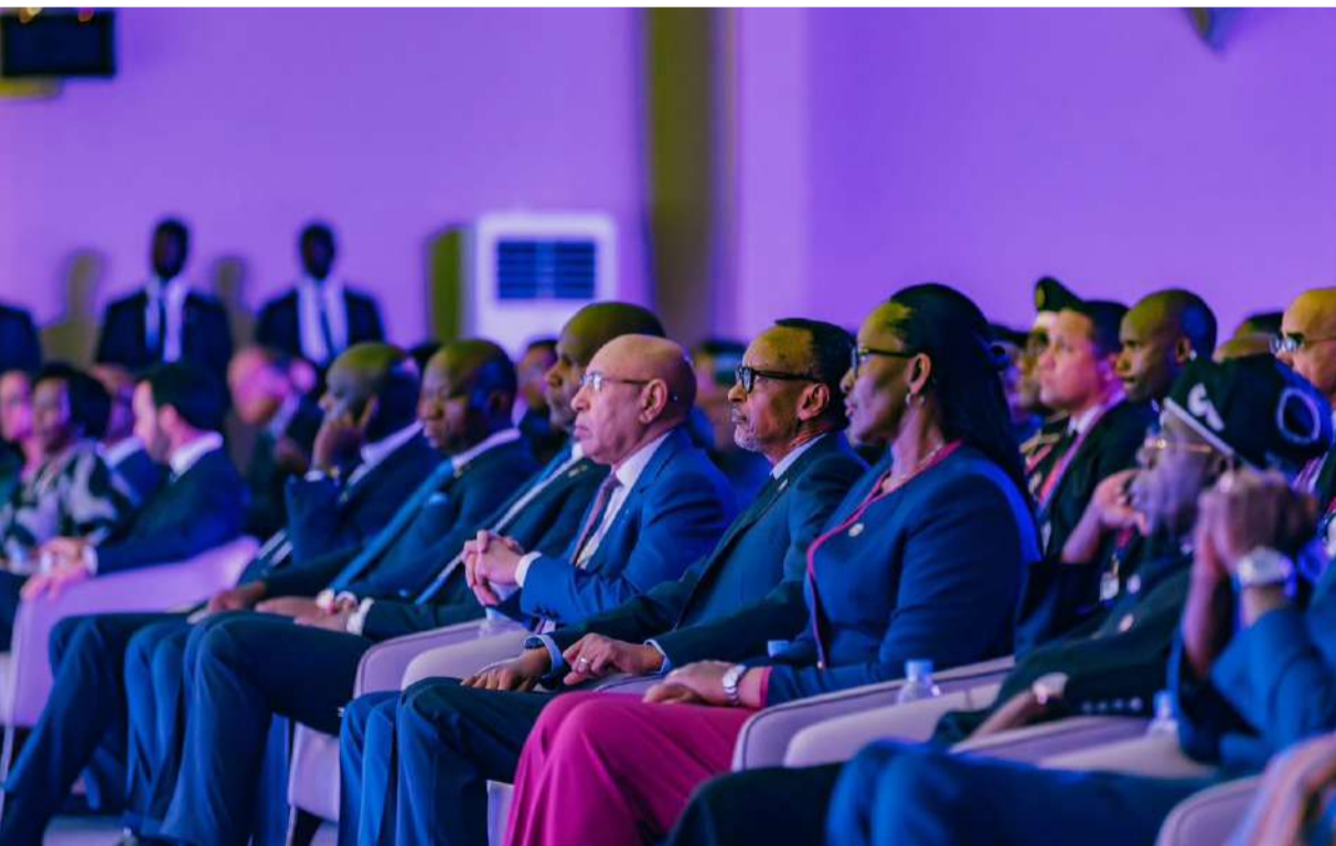
Perezida Paul Kagame na Madamu Jeannette Kagame ni bamwe mu banyacyubahiro bitabiriye itangizwa ry'Inama ya Africa CEO Forum ibaye ku nshuro ya 13