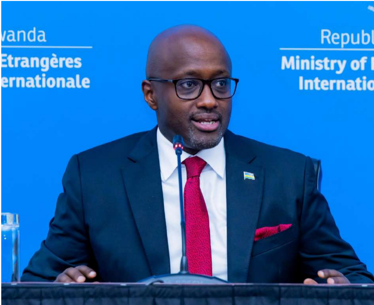
Minisitiri w'Ububanyi n'Amahanga n'Ubutwererane w'u Rwanda, Amb Olivier Nduhungirehe