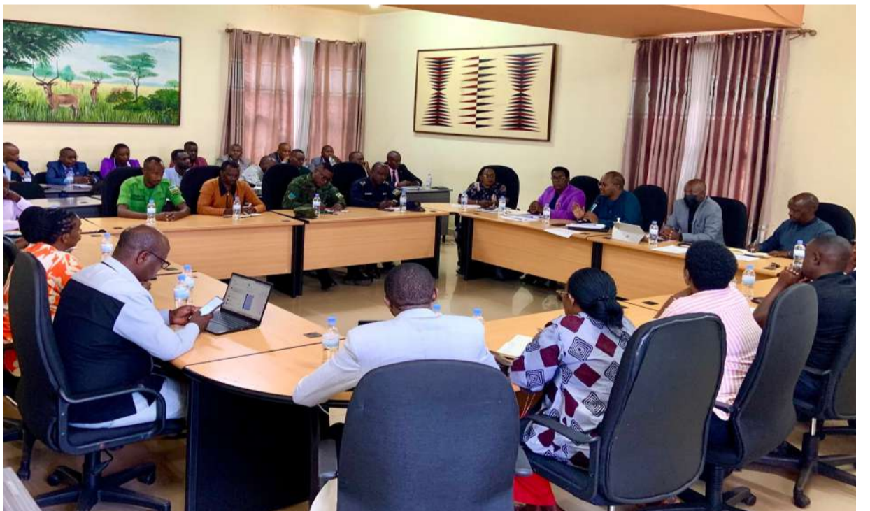
Aha bari mu nama yo gusuzuma no kuganira ku myitwarire mbonezamurimo y'abakozi ba Leta