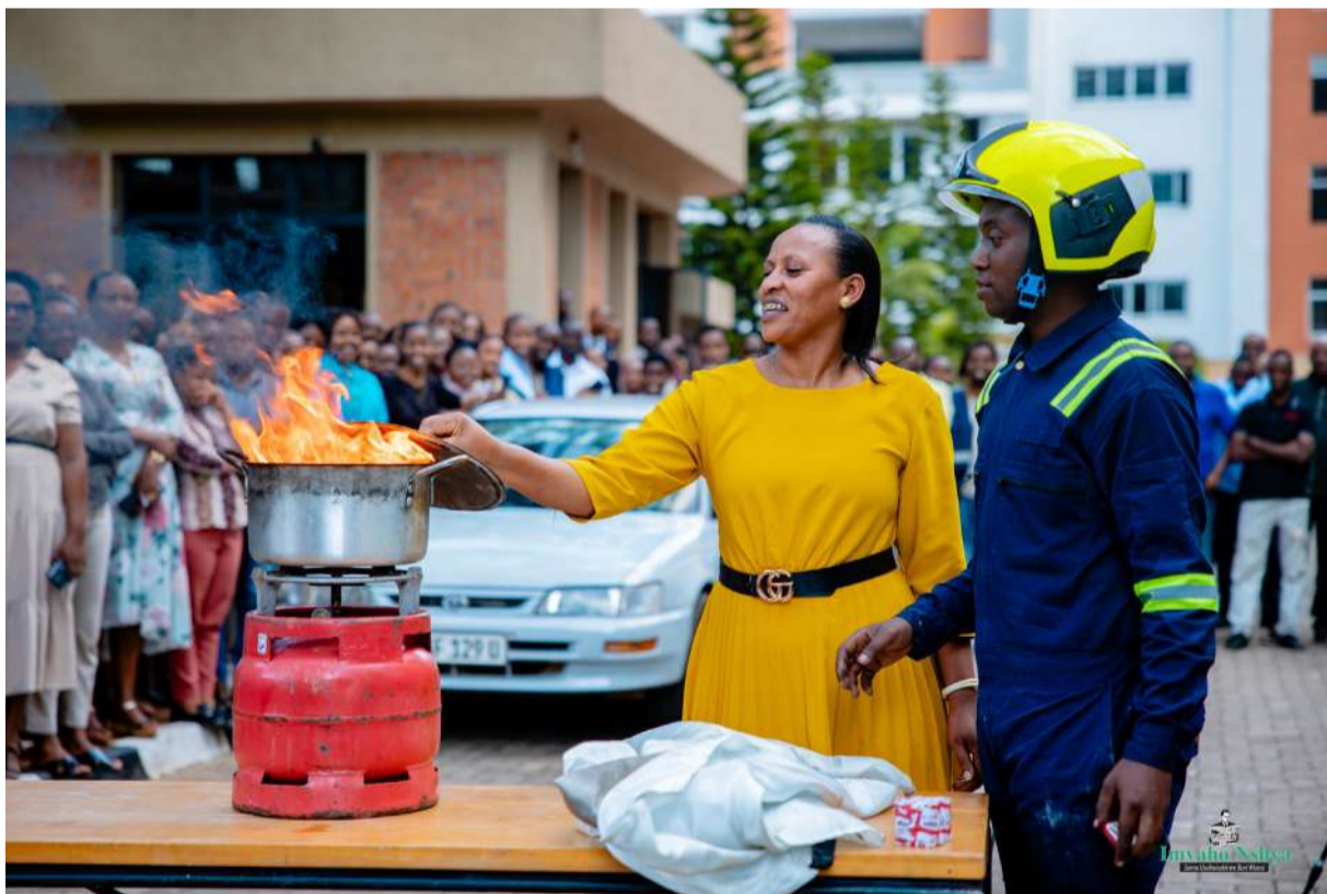
Bahawe umwanya wo kugaragaza ko ibyo bize babyumvise

Muri iki gikorwa havugijwe impuzura zimenyekanisha ko hagiye kuba inkongi, abakorera muri iyi nyubako basohoka bumva ko ari inkongi iteye hagamijwe kureba igihe byatwara ngo bamenye ko inkongi ibaye, guhunga aho ibereye no kureba ko basobanukiwe aho bashobora guhungira hazwi ka (Assembly Point), uko