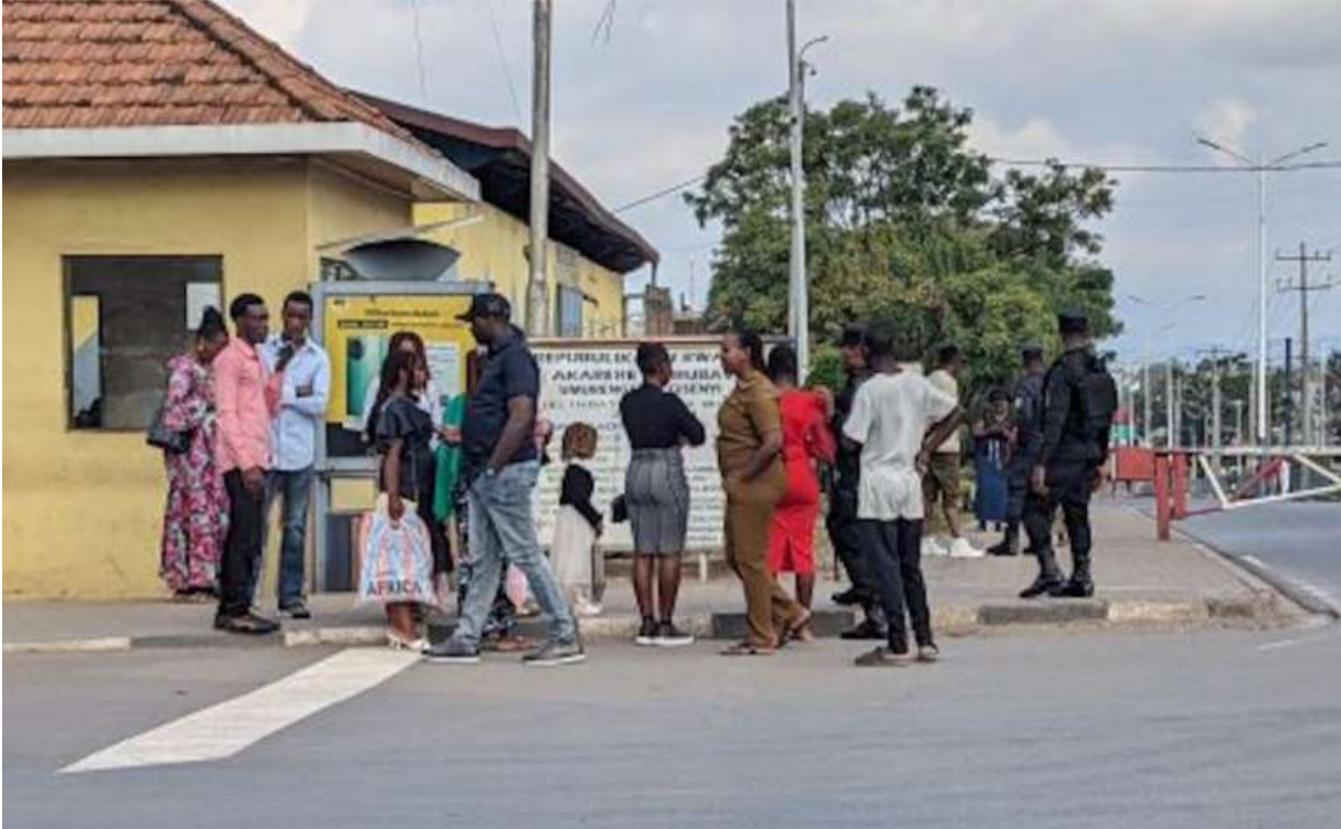
Imipaka ihuza u Rwanda na RDC (Gisenyi na Goma) irafunze kubera icyorezo cyagaragaye muri RDC na Uganda