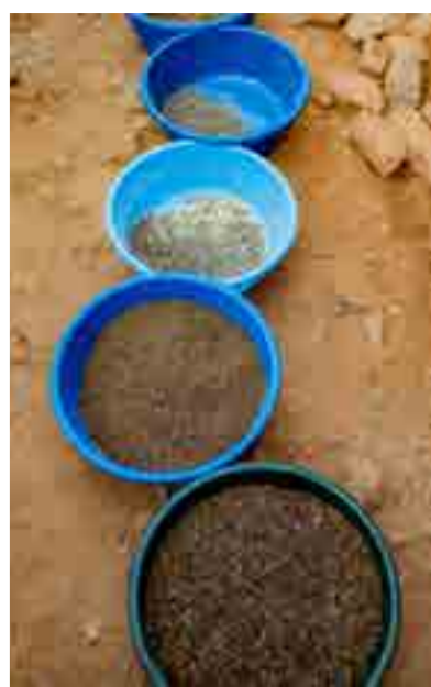
Aborozi bifashisha inigwaha-babiri (amasazi y'umukara) mu kubonera amatungo ibiryo bikungahaye ku ntungamubiri

Yagize ati: "Ibiryo by'amatungo byarahenze, aho bigura amafaranga y'u Rwanda 810 cyangwa 800 Frw bivuye kuri 750 Frw ku kilo, kandi bituruka kure umuntu aba agomba kubitegera kuko bituruka kure i Rubengera.