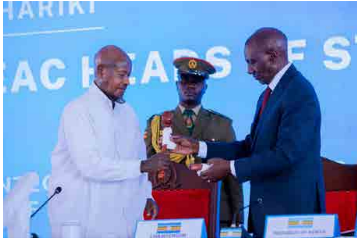
Perezida Museveni yagizwe Umuyobozi Mukuru wa EAC asimbuye mugenzi we wa Kenya Dr William Ruto

Umwanya w'Ubunyamabanga bwa EAC utorerwa