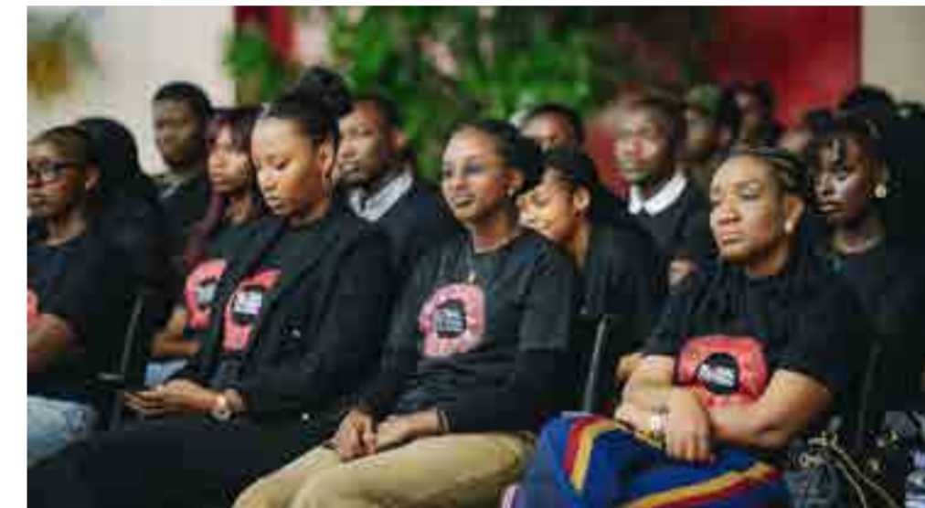
Urubyiruko rugirwa inama yo kwirinda ibiyobyabwenge