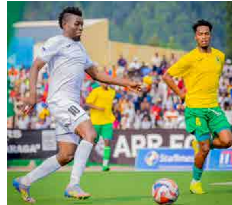
APR FC yanganyije na Marines FC ibitego 2-2