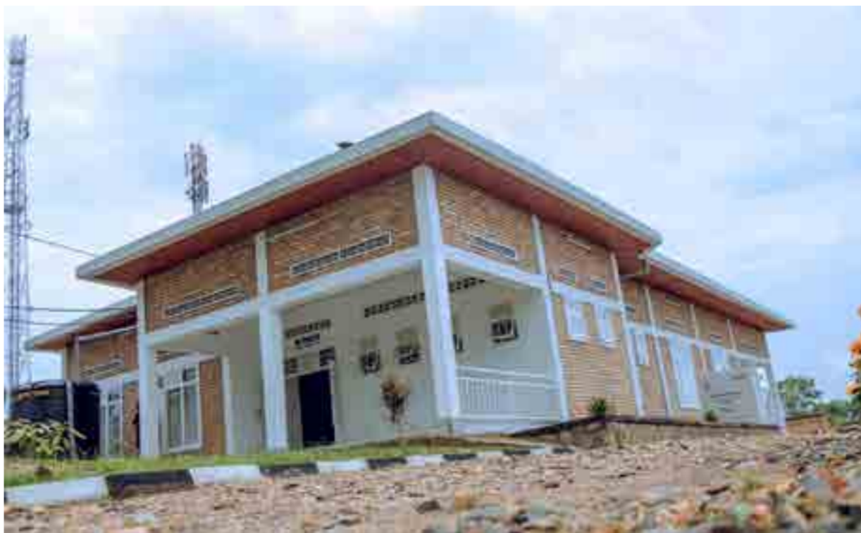
Hubatswe inyubako y'inzu y'ababyeyi yababereye igisubizo