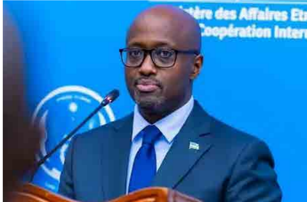
Minisitiri w’Ububanyi n’Amahanga n’Ubutwererane, Amb. Olivier Nduhungirehe

Minisitiri w’Ububanyi n’Amahanga n’Ubutwererane, Amb Olivier Nduhungirehe, yashimye umwanzuro uherutse gufatwa n’ihuriro mpuzamahanga (International Contact Group: ICG) rigizwe na Leta Zunze Ubumwe z’Amerika n’ibihugu by’u Burayi ku kibazo cy’umutekano muke mu Burasirazuba bwa Repubulika Iharanira Demokarasi ya Congo (RDC) ryagaragaje ko bikwiye gukemurwa mu mahoro hatabayeho intambara.