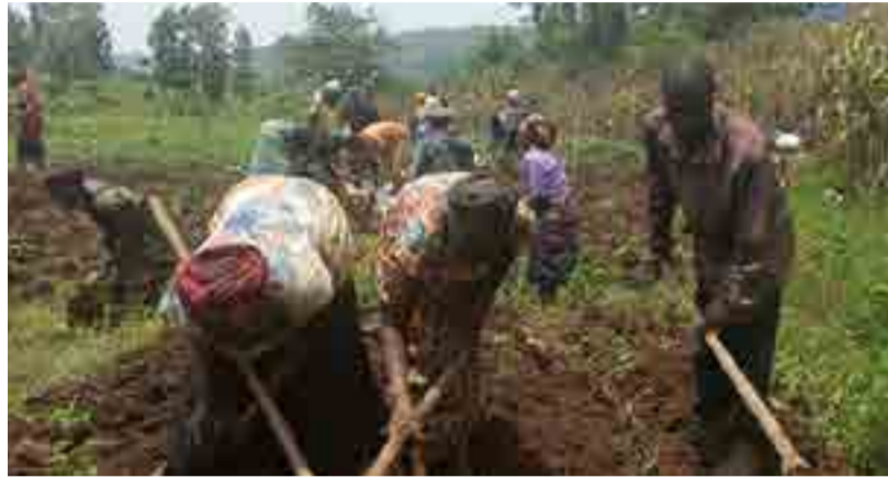
Nyuma yo gukora, abibumbiye mu makoperative banaganira ku bibateza imbere