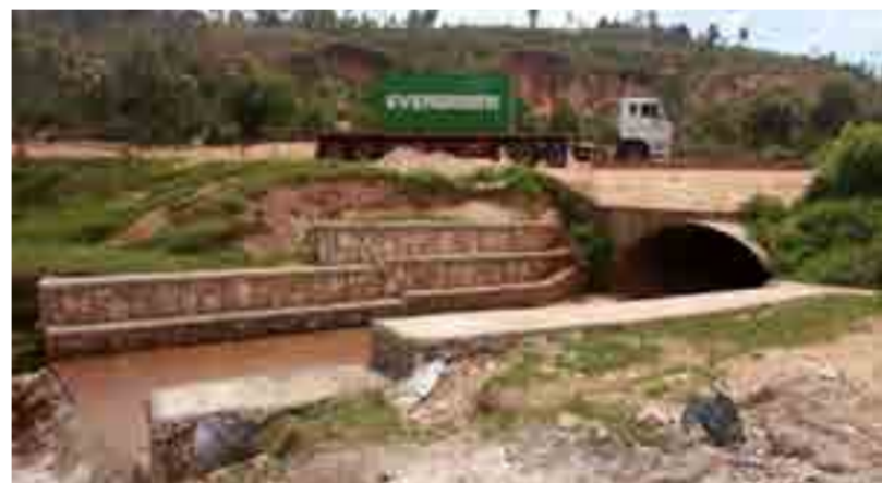
Imodoka ziremereye zatizaga umurindi kwangirika k'umuhanda

ryasanwa amazi yabonye inzira atacyuzura mu muhanda kandi n'imodoka ziremereye zihanyura nta kibazo, ariko ritarakorwa ngo wasangaga imodoka ziremereye zigira uruhare mu kwangirika kwaryo.