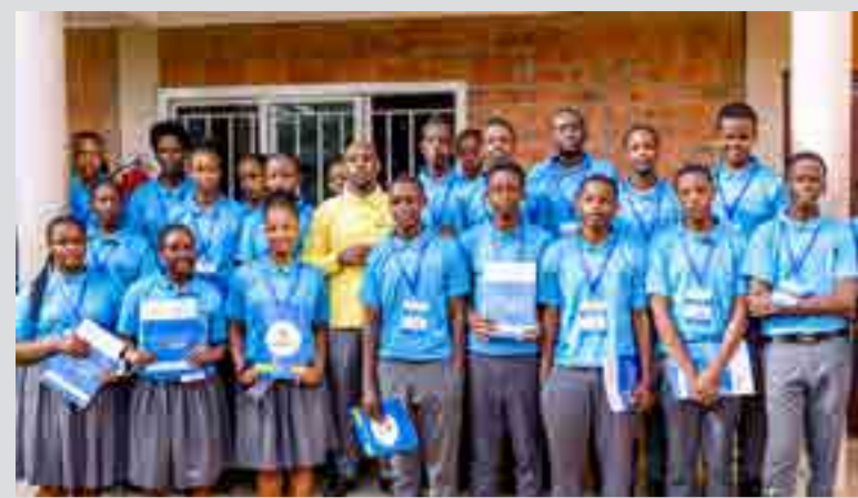
PISA ifasha kunoza integanyanyigisho n'ingamba zo kwigisha