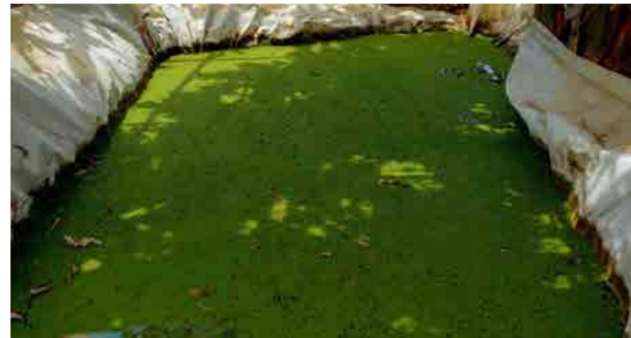
'Azolla' ifasha aborozi kugaburira neza amatungo yabo