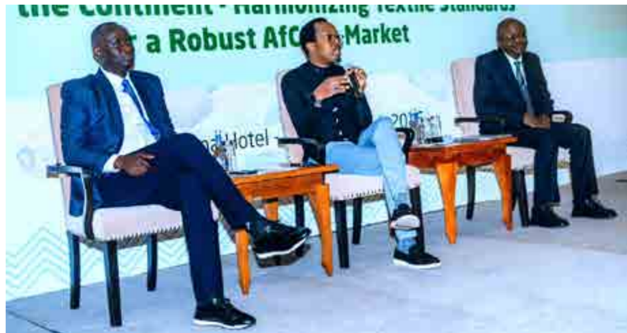
Hakomeje gushakishwa uburyo bwo gushyiraho ibwiriza rimwe ry'ubuziranenge mu bihugu 54 by'Afurika

NISR yerekana kandi ko abanyamahanga binjije mu Rwanda banyuze ku mipaka y'ubutaka basize miliyoni 24.9 $. Impamvu nyamukuru y'izo