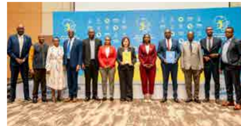
Bidasubirwaho, u Rwanda rwahawe kwakira Shampiyona Nyafurika y'amakipe yabaye aya mbere iwayo muri Volleyball

zayire, yavuze ko inshingano z'u Rwanda ari uko irushanwa rizahuza amakipe akomeye muri Afurika rizagenda neza. Ati "Dutegereje kwakira ibihangano, abakinnyi no kwerekana impamvu u Rwanda ruri ku isonga mu kwakira ibikorwa bya siporo. Dufatanyije, twizera ko iri rushanwa rizatanga umusaruro, rikagenda neza."