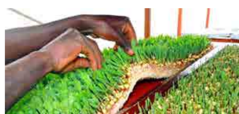
Binyampeke bimejeje bitanga ibiryo by'amatungo byiza

Yakomeje asobanura ko baturanye n'uruganda rusya umuceri bagenda bakagura 'son de riz', baza bakavangamo inigwaha-babiri, ubundi bagakora imvange yabyo, tukagaburira amatungo yabo ibiryo byuzuye neza.