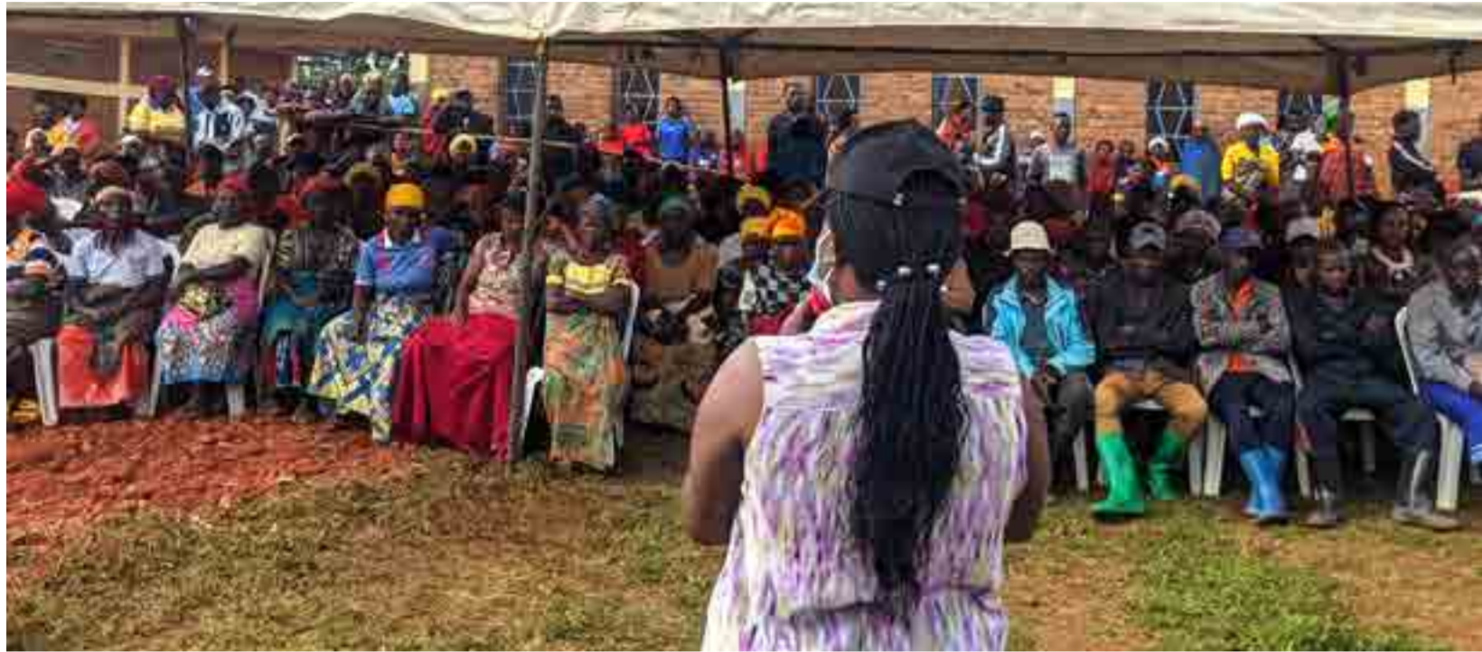
Yagiye abeshywa akazi yisanga acuruzwa