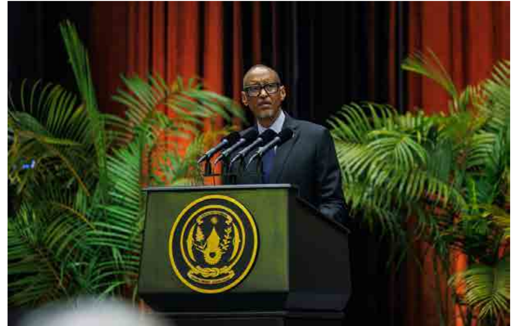
Perezida Kagame yashimangiye ko u Rwanda rukomeza guharanira ko umutekano warwo udahungabanywa na FDLR n'abayishyigikiye

Ati: "Leta ya Congo yahaye uyu mutwe ubufasha bwa politiki n'ubw'amafaranga, ndetse inawinjiza mu nzego z'ingabo zayo, aho ukorera nta nkomyi. Uyu mutwe wagabye ibitero ku Rwanda inshuro nyinshi. Ibyo byatumye ibihugu bimwe bitanga amatangazo bigira inama abaturage babyo kwitondera ingendo.