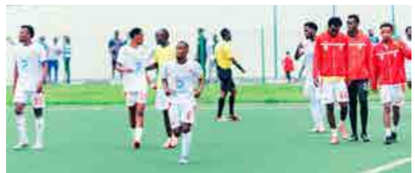
Abakinnyi ba Etincelles bishimira igitego