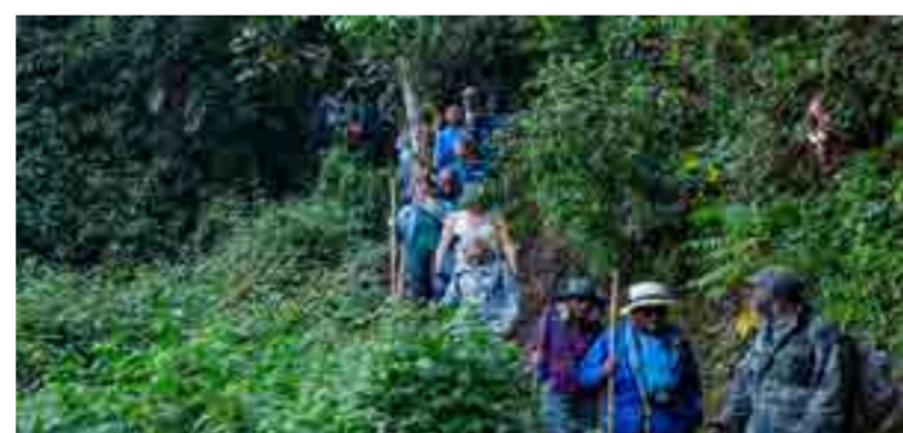
Abanyamahanga bakunda gusura u Rwanda bikarwinjiriza amadovize

Yagize ati: "Turateganya ko umugabane w'Afurika wakoresha ibwiriza rimwe, kugira ngo tugabanye umubare w'amafaranga atangwa muri Laboratwari kugira ngo bapime ibicuruzwa, ibyo bikazanadufasha kwemera ibicuruzwa biturutse mu bindi bihugu