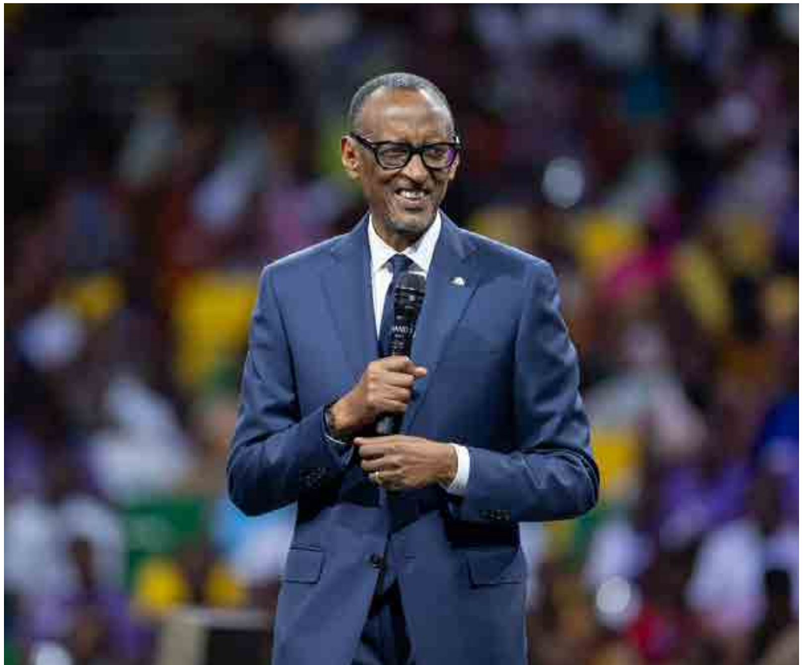
Perezida Paul Kagame ahamya ko kwimakaza uburinganire byagaragaje uruhare abagore bakomeje kugira mu iterambere ry'u Rwanda