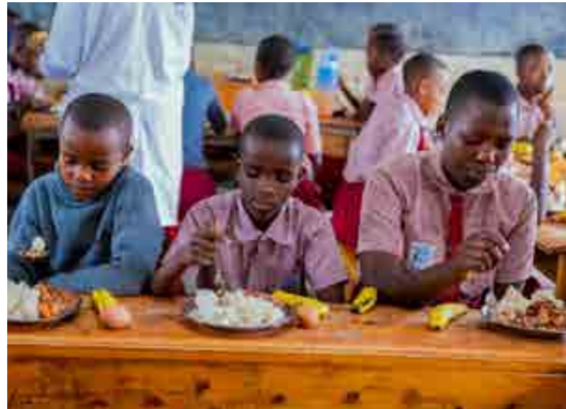
Abana ntibagita ishuri kubera amafunguro ya saa sita bahafatira

Yagize ati: "Gufatira ifunguro ku ishuri byongereye abana