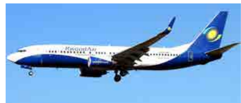
RwandAir yiteguye gufasha Abanyarwanda bari mu bihugu bya UAE bifuzaga gutaha

Ubufatanye bw'u Rwanda na Kazakhstan ni inzira nshya y'iterambere, buzafasha u Rwanda kongera imbaraga mu mabuye y'agaciro, guteza imbere ubuhinzi bugezweho no kwagura amasoko y'ubucuruzi ku rwego mpuzamahanga.