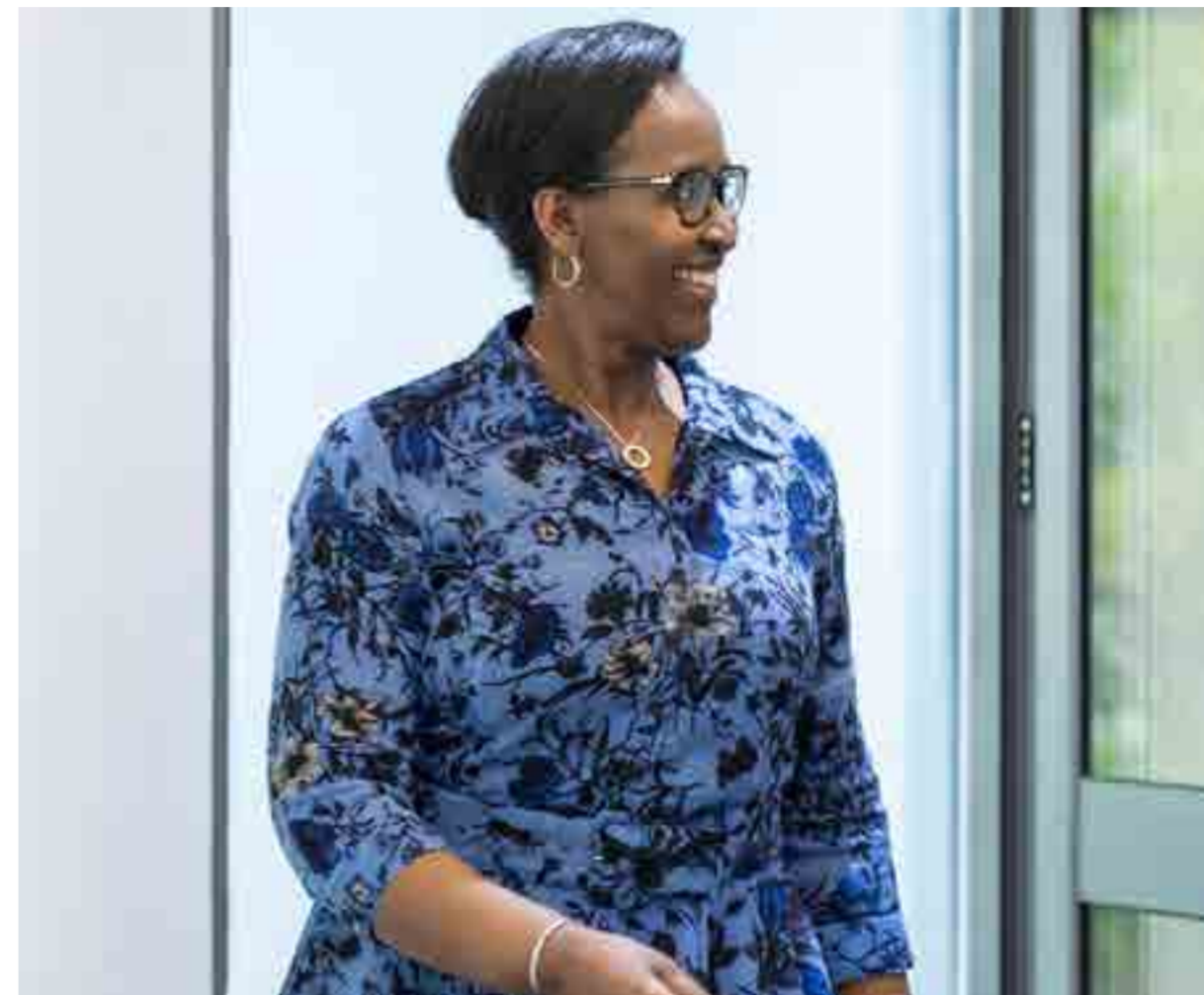
Madamu Jeannette Kagame yibukije abagore n'abakobwa kwikunda nk'uko bakunda abandi

Yakomeje abasaba guharanira kwiyubaka, agira ati: "Kuri uyu muni twizihiza abagore, ndabasaba kongera